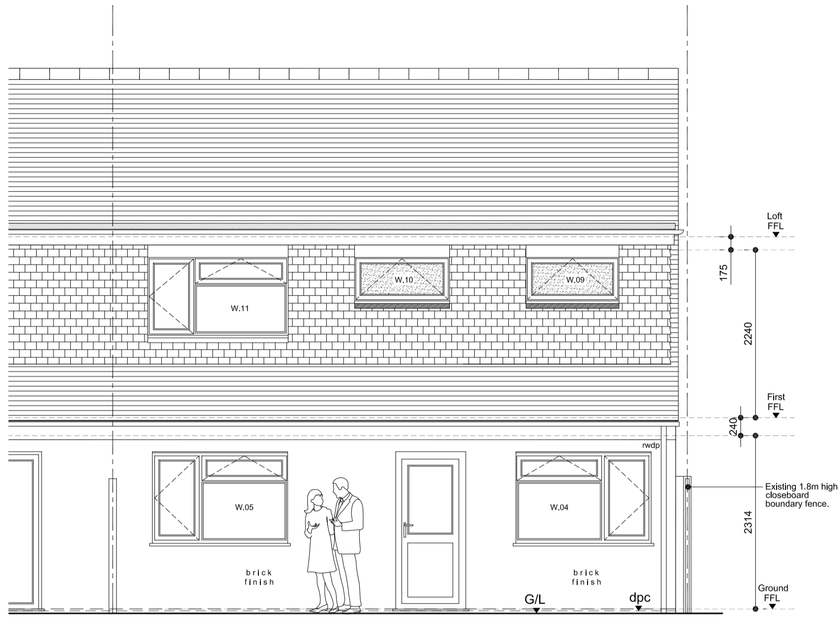
002 Existing - Rear Elevation 01 Scale 1:50 @A1