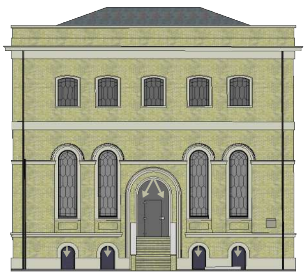
WEST ELEVATION MORELANDS ENGINE HOUSE