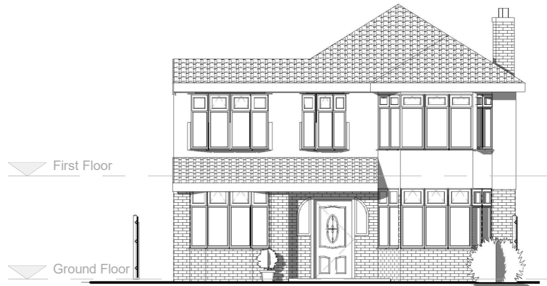
Proposed Front Elevation 1 : 100