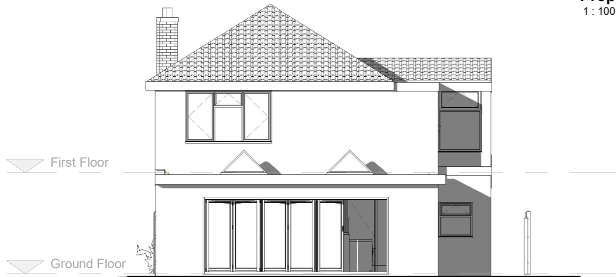
Proposed Rear Elevation 1 : 100