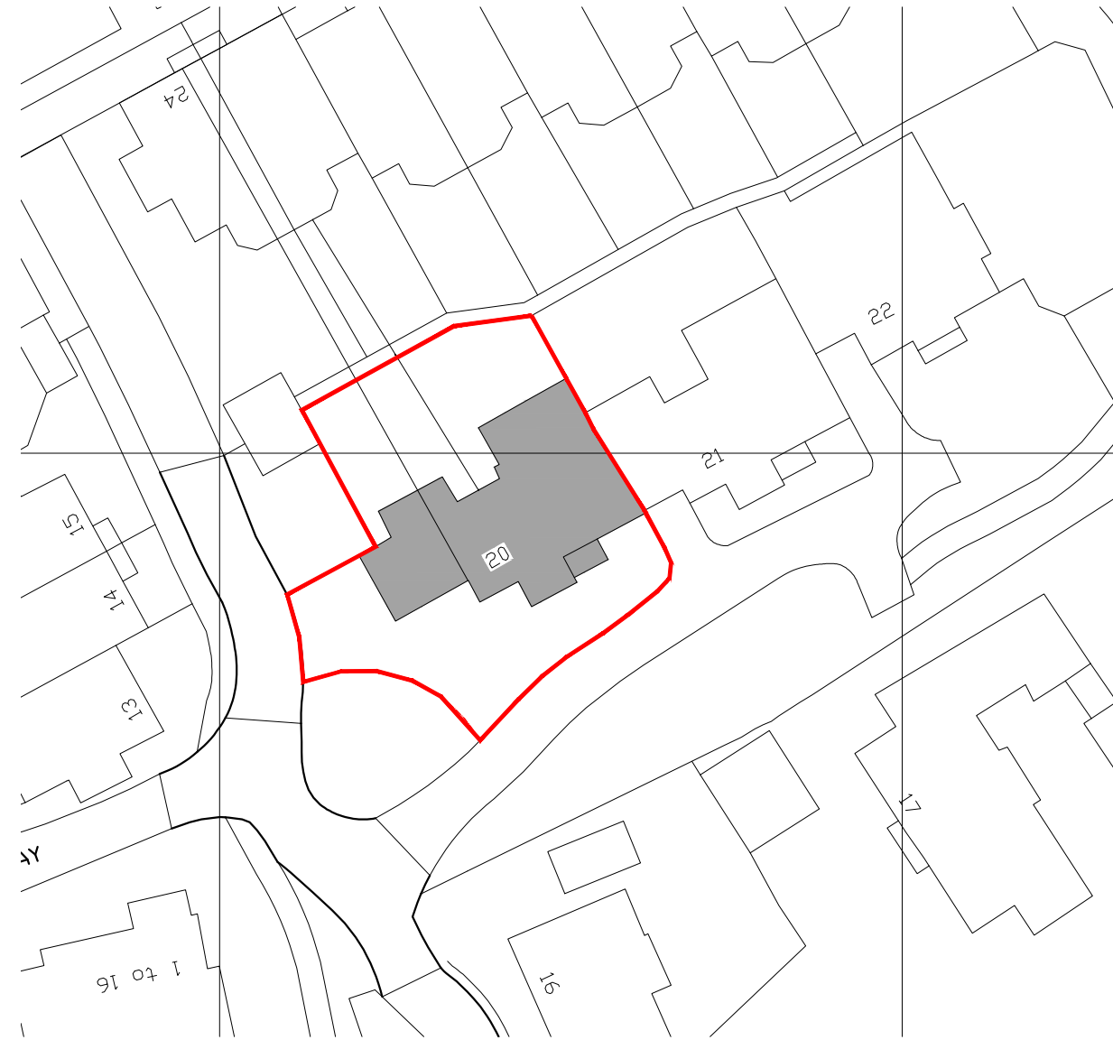
Site Location Plan Scale 1:500