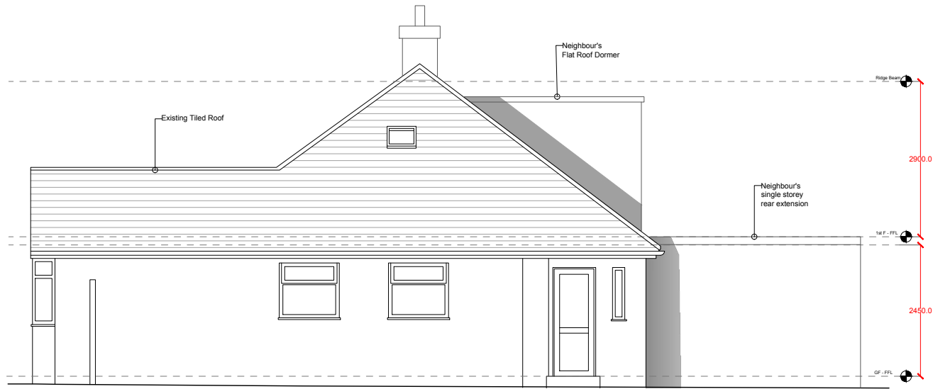
Existing Side Elevation (C)