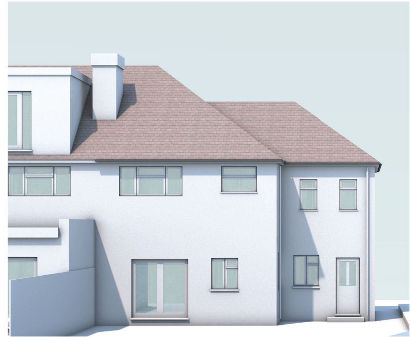
2 Rear Elevation