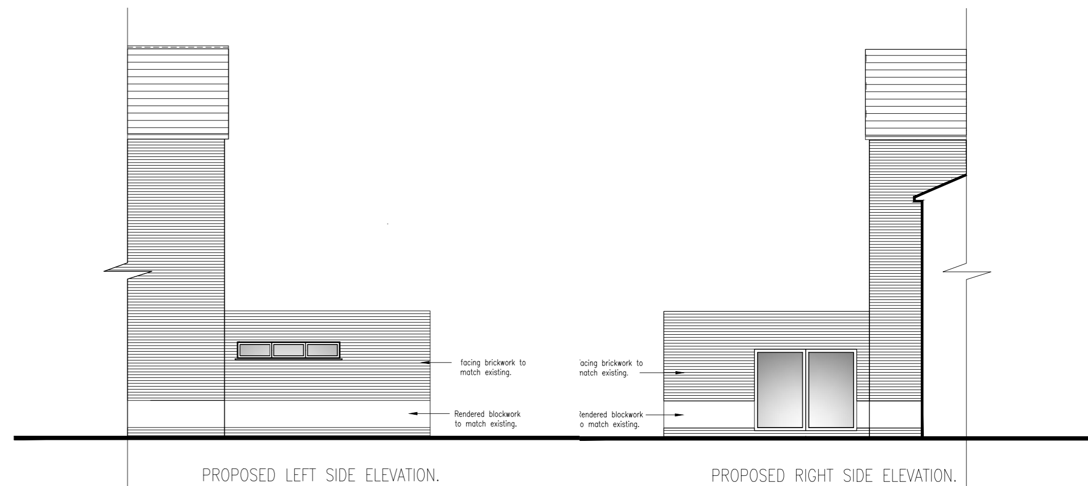
PROPOSED LEFT SIDE ELEVATION.