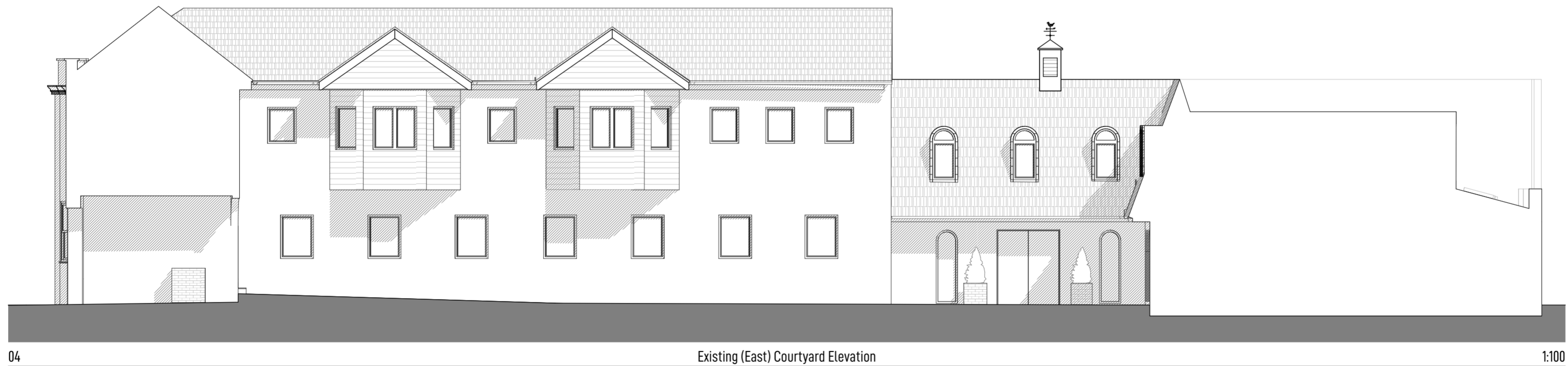
04 Existing (East) Courtyard Elevation 1:100