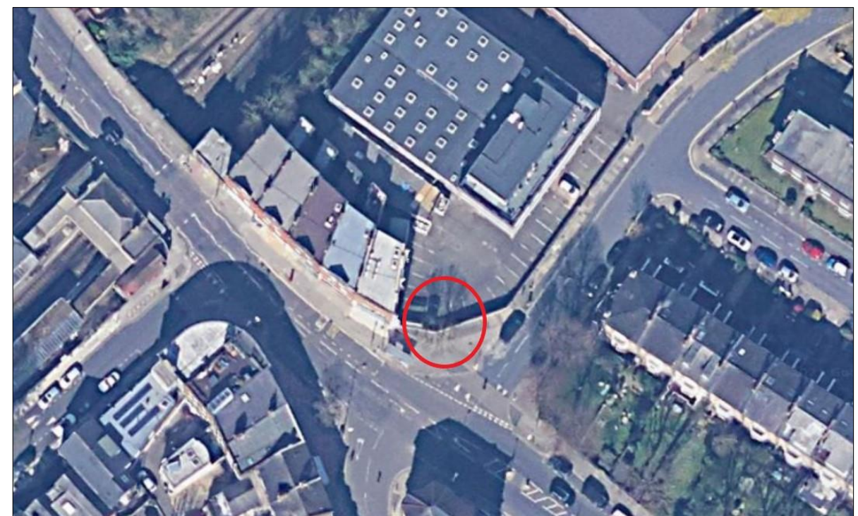
Figure 1 Aerial view of tree positions

1.9. This further details of the various benefits and limitations of the various tree valuation systems, Forest Research (the research body of the Forestry Commission) have developed a useful Research Note on the subject (Sarajevs 2011).