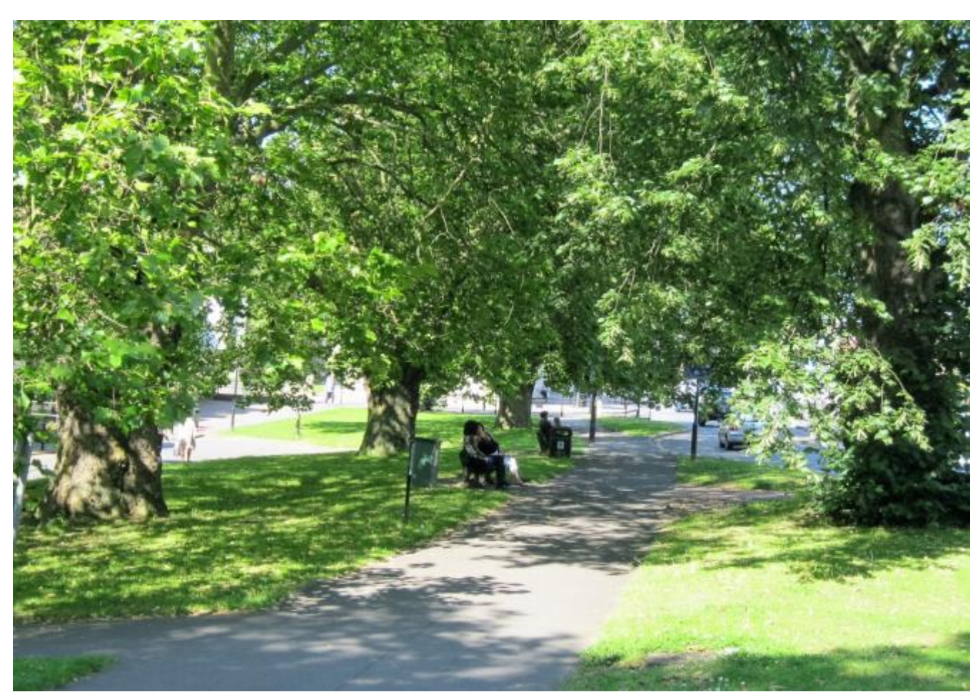
Group of lime and London Plane, Epping: values from £160K- £265K