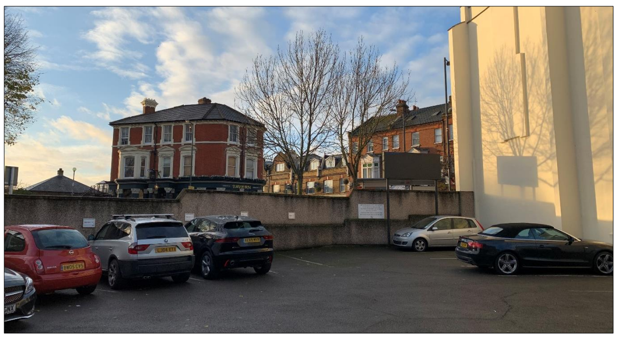
Figure 2 View of subject trees taken at time of original tree survey (16/12/20).