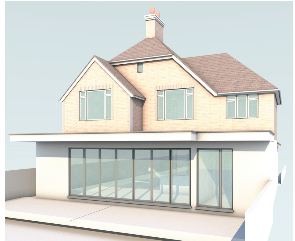
2 Rear Ele