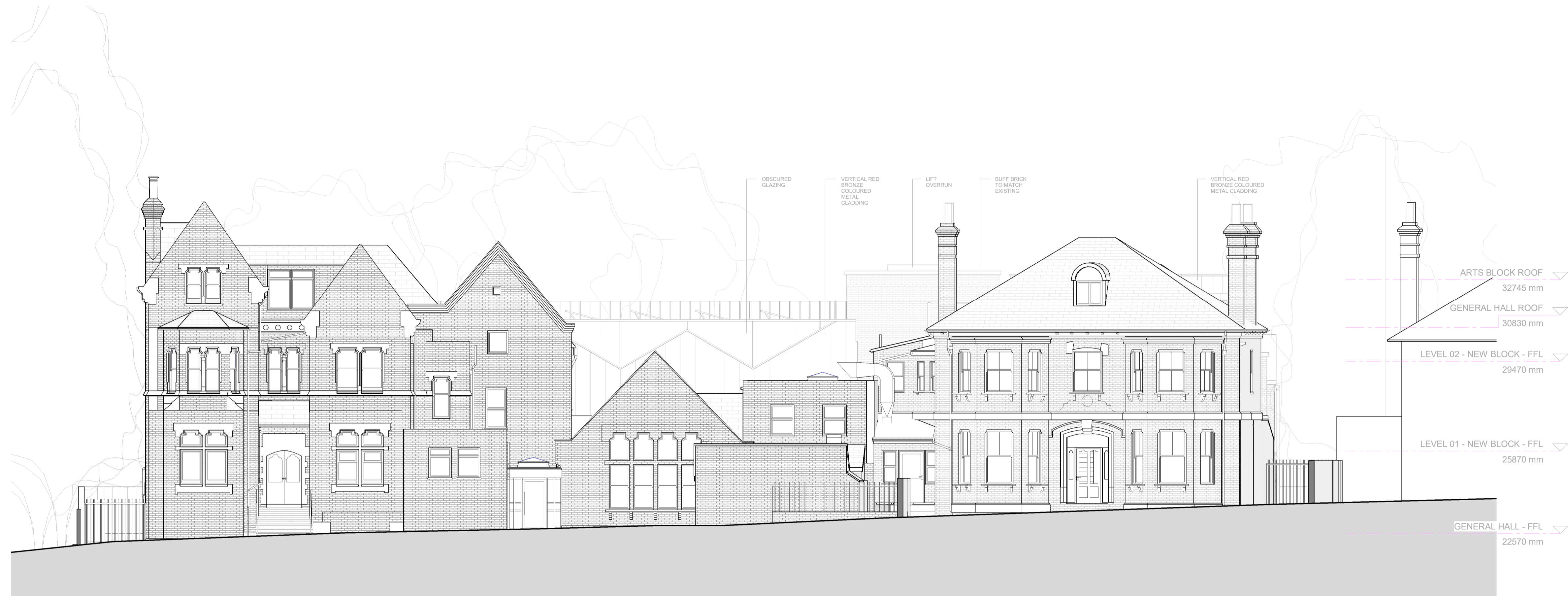
5 ELEVATION STREET ELEVATION 1 : 100