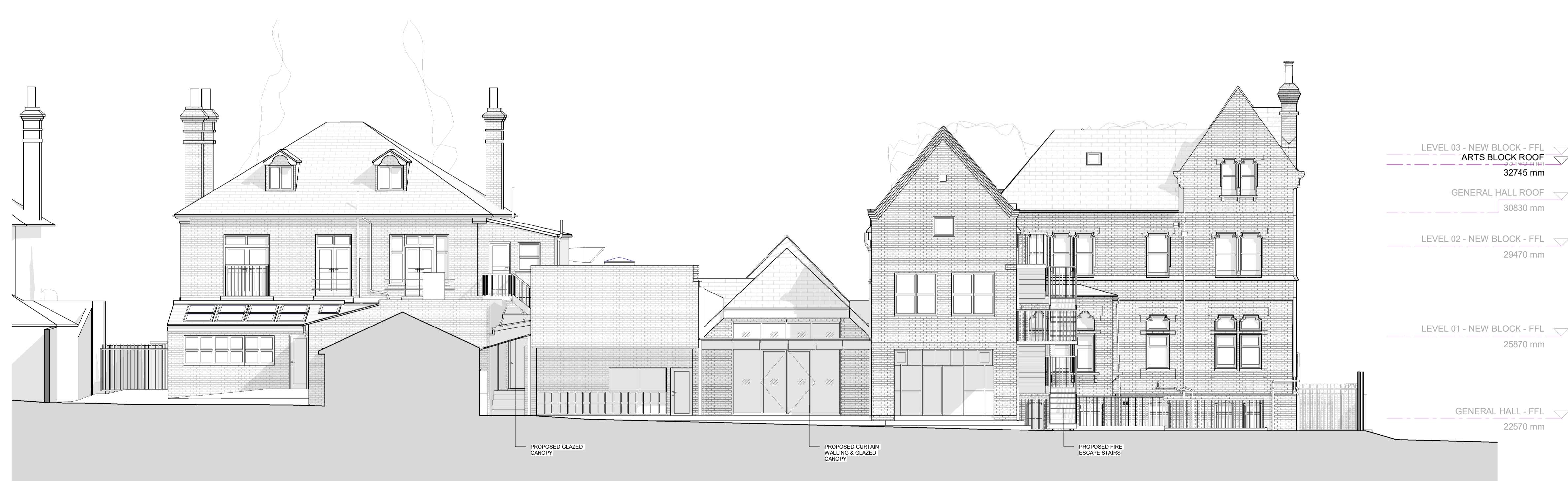
6 ELEVATION COURTYARD - EAST ELEVATION 1 : 100