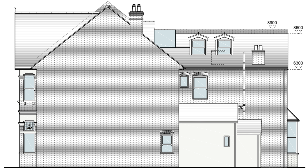
Side Elevation (No. 251) - Proposed