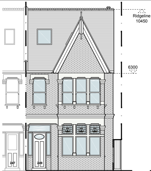
Front Elevation - Proposed