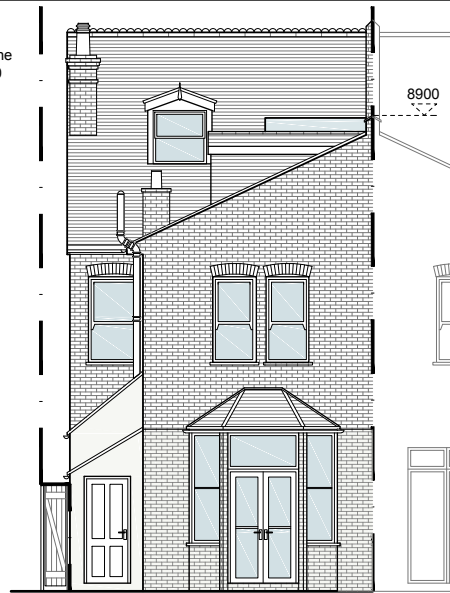
Rear Elevation - Proposed