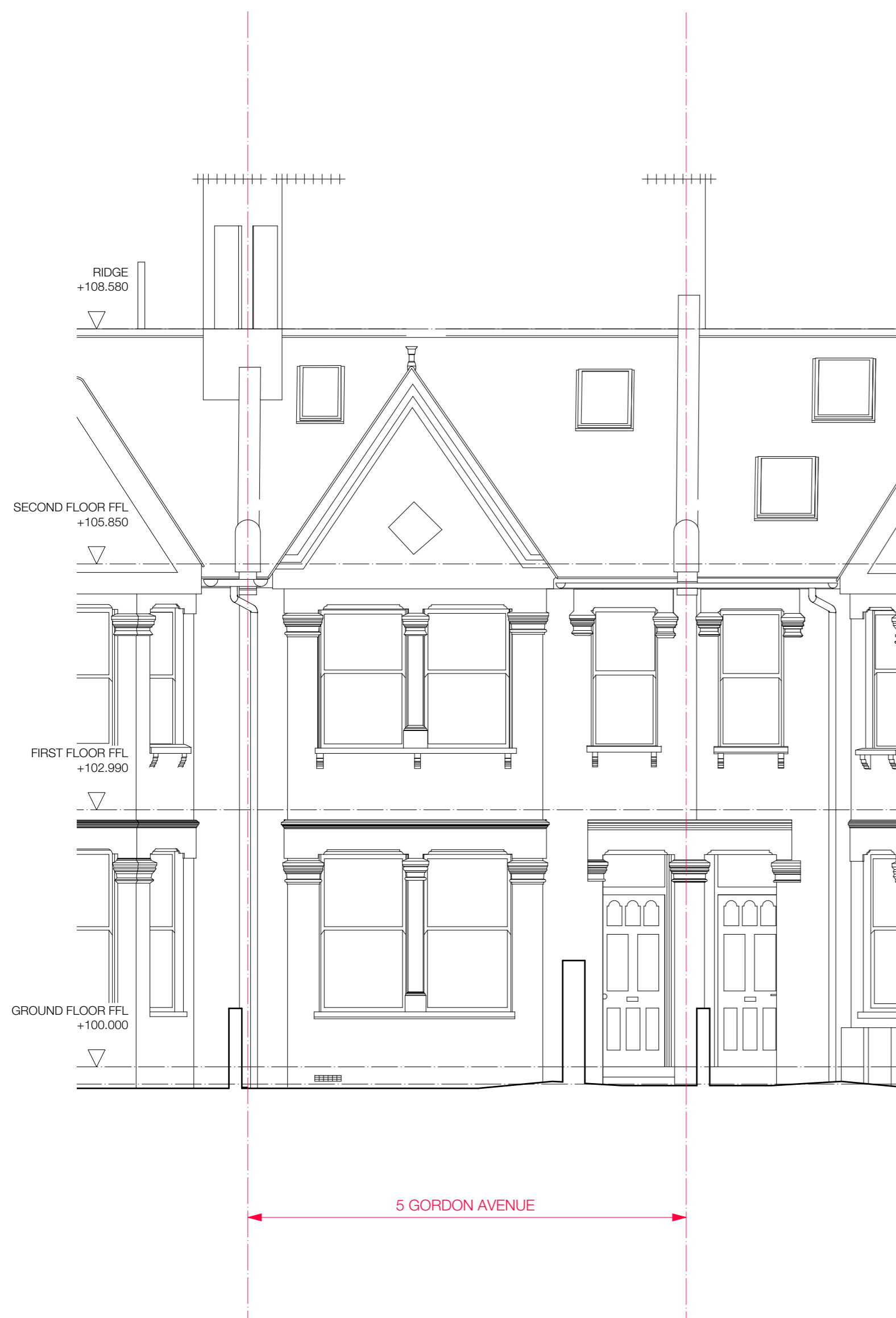
FRONT ELEVATION (AS EXISTING)