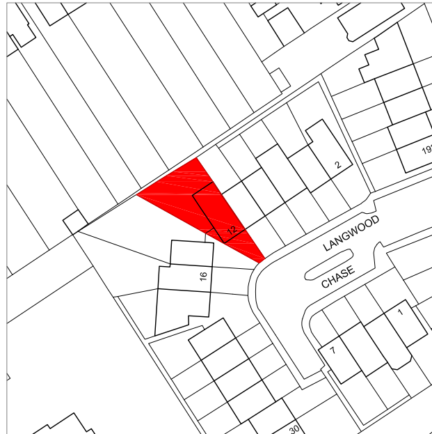
01 Location Plan@1:1250