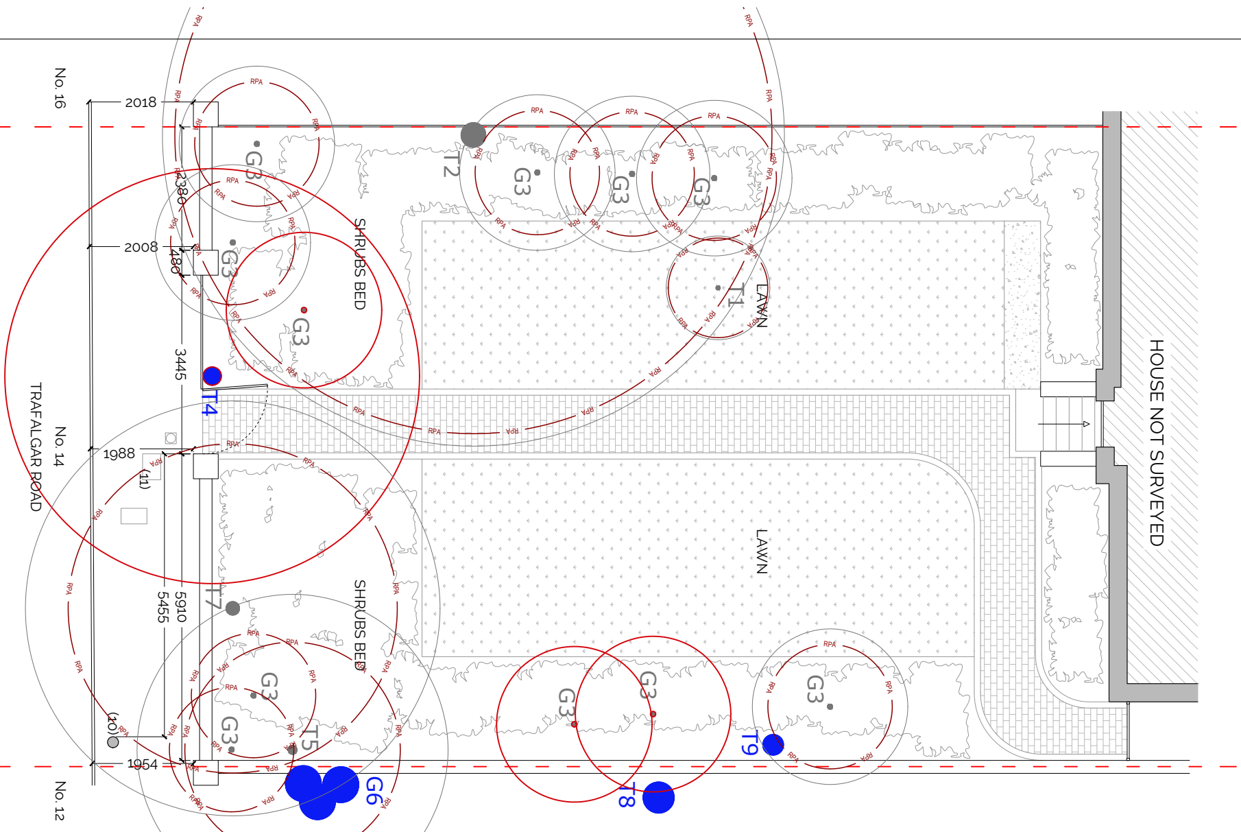
PLAN - EXISTING Scale 1:100