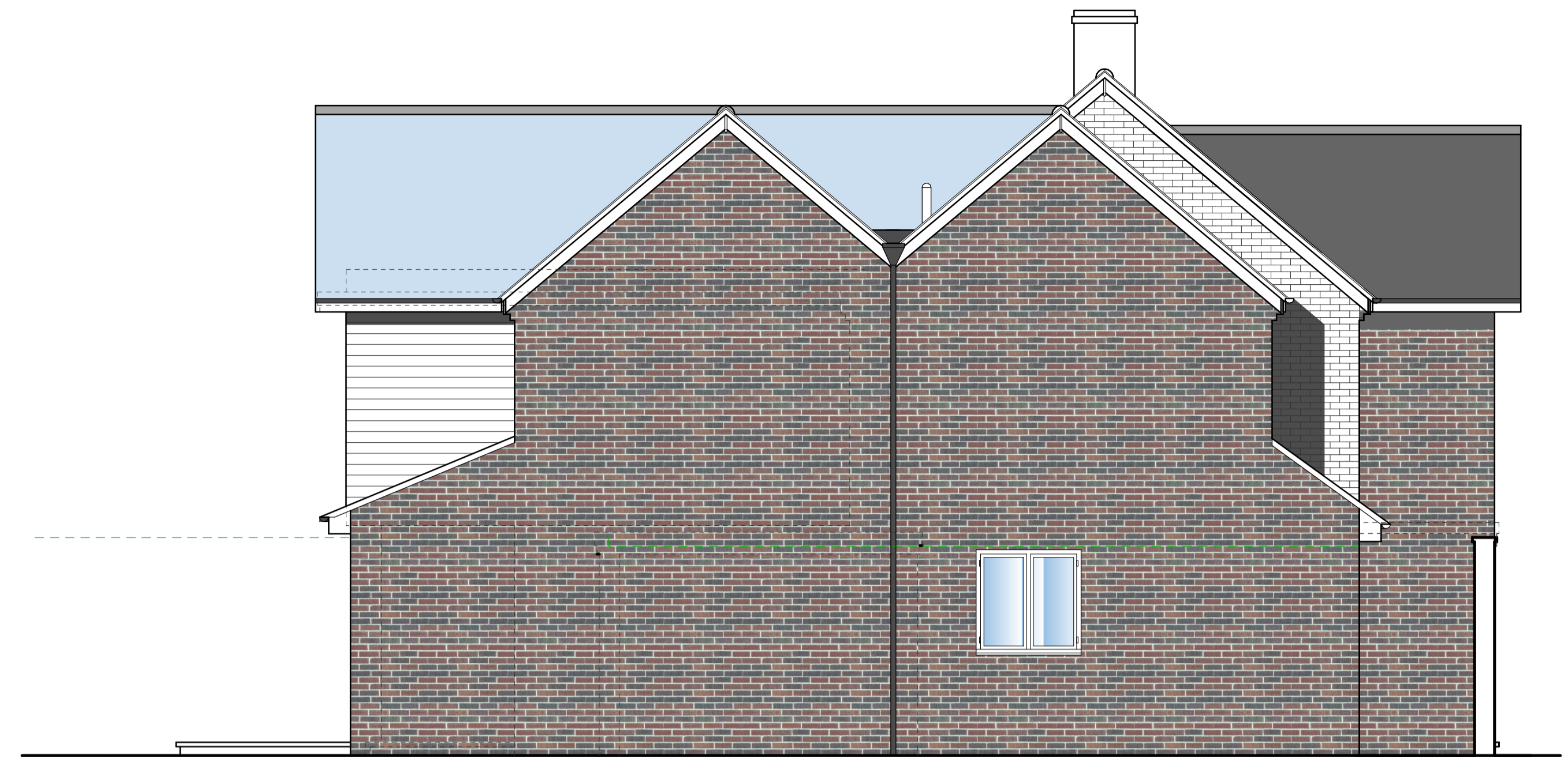
SOUTH SIDE ELEVATION