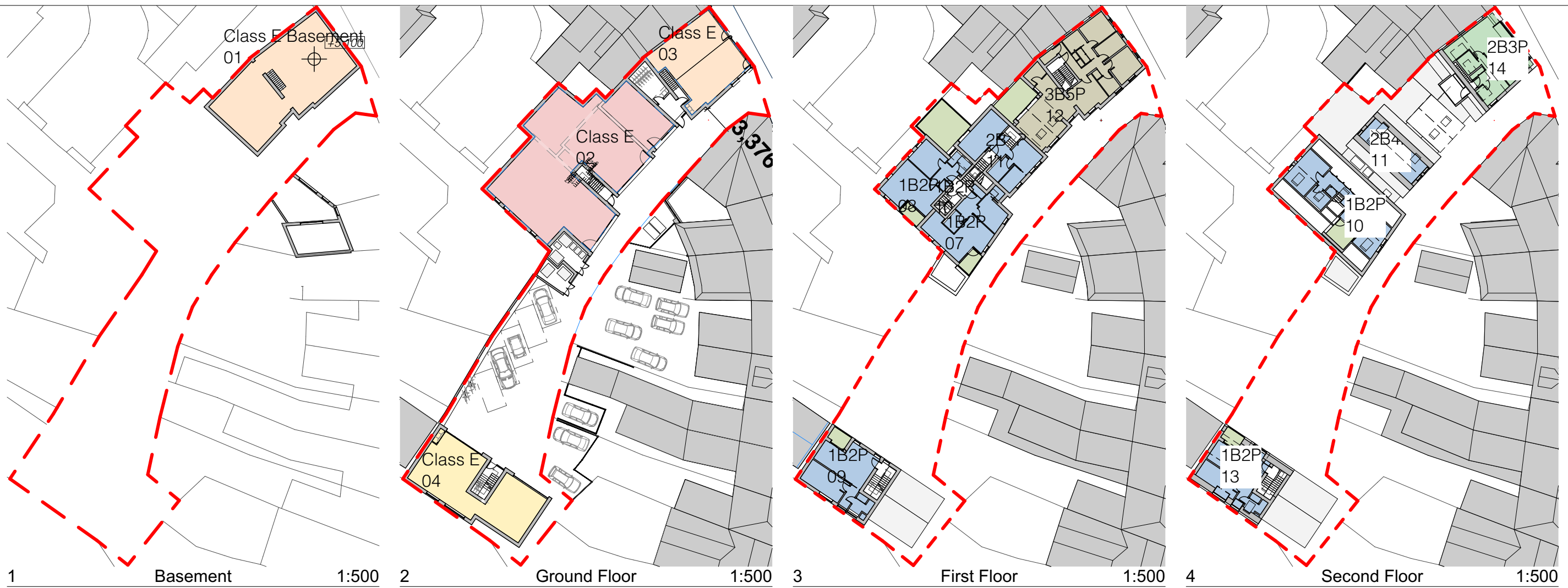
1 Basement 1:500 2 Ground Floor 1:500 3 First Floor 1:500 4 Second Floor 1:500