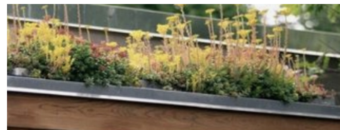
Green Roof - Wildflower