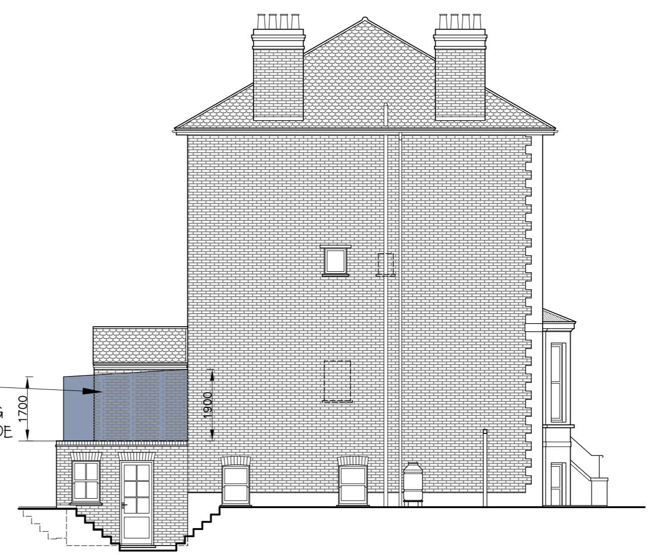
3 - SIDE ELEVATION