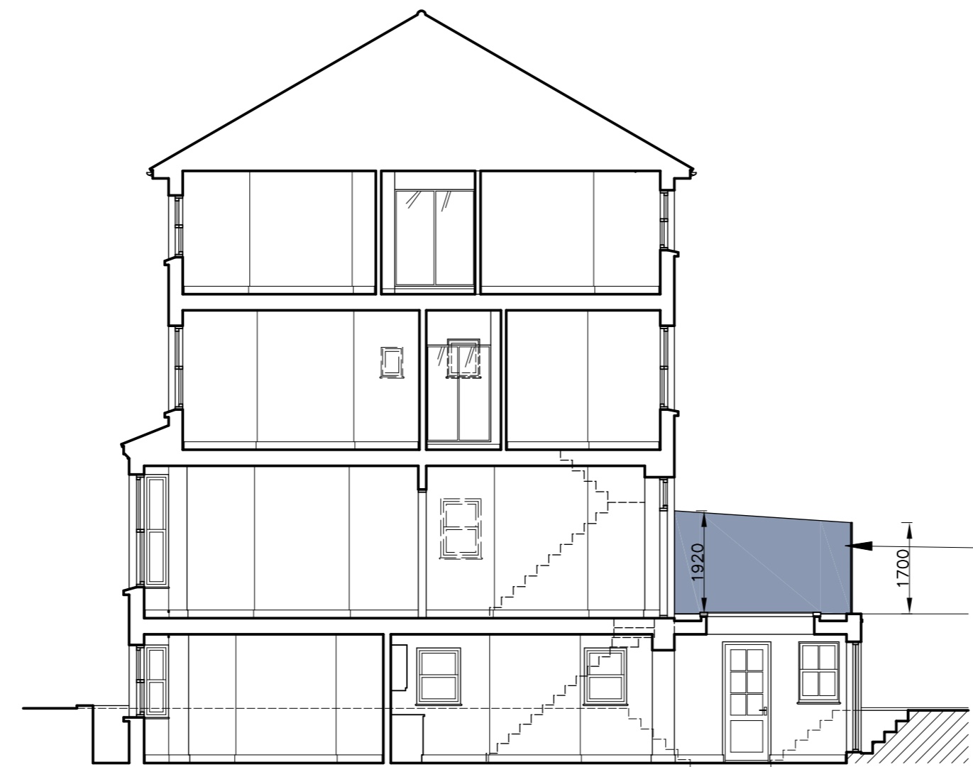
4 - SECTION