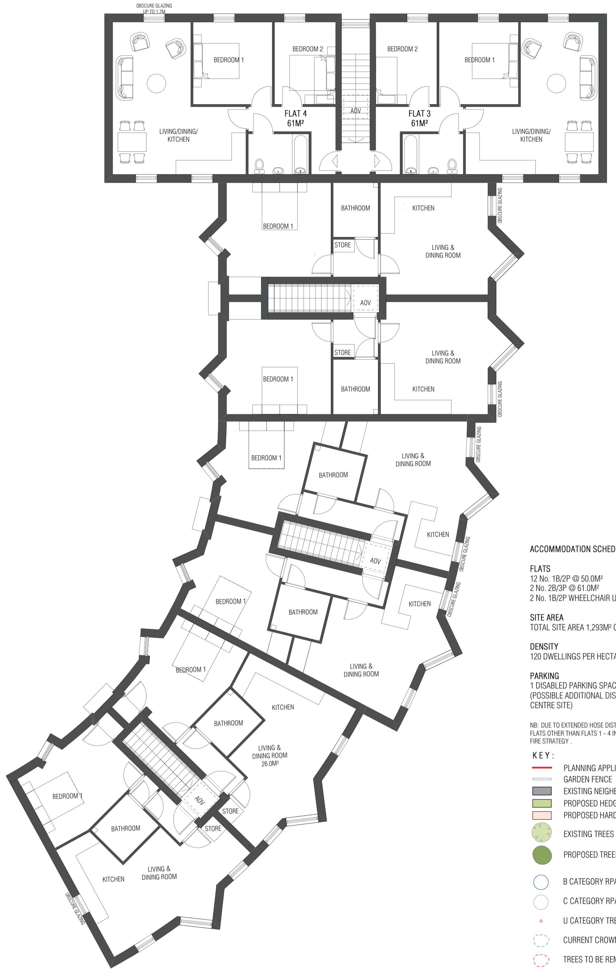
FIRST FLOOR PLAN 1:100