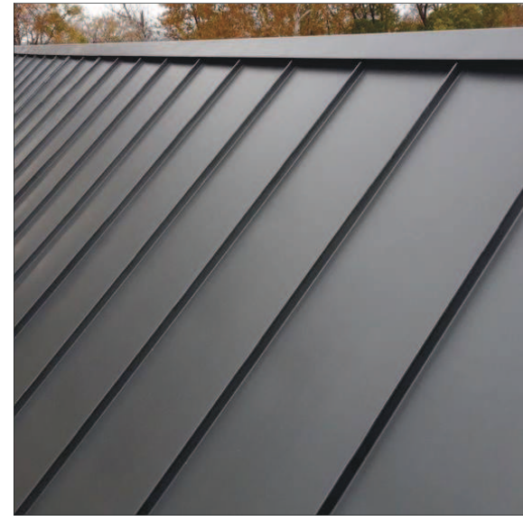
VM ZINC QUARTZ-ZINC OR SIMILAR APPROVED

TO ROOF, ENTRANCE CANOPY AND COPING FLASHING OVER BRICK GABLE PARAPETS COLOUR GREY