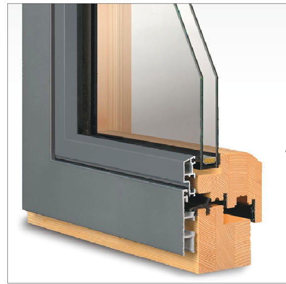
WINDOWS, DOORS, BRISE SOLEIL

215 DEEP PREFORMED RED RUBBER BRICK (W T LAMB AND SONS) WINDOW ARCHES, REVEALS AND CILLS, LIME MORTAR MIX 4MM JOINTS, GABLE REDS TO BE SUSSEX HANDMADE WAVERLEY REDS