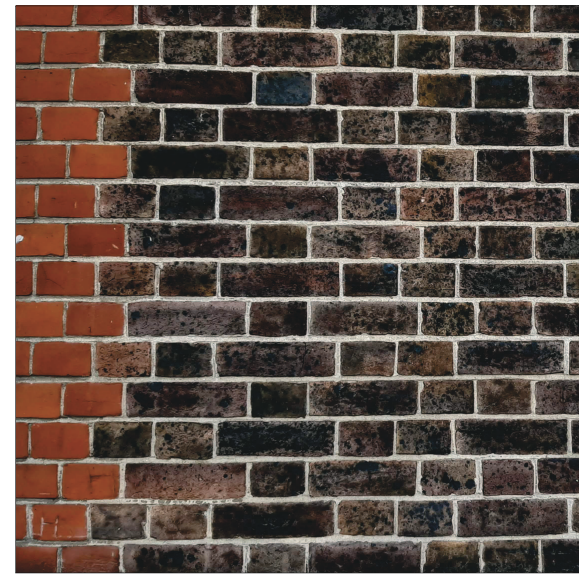
DARK STOCK BRICKS

TO ROOF, ENTRANCE CANOPY AND COPING FLASHING OVER BRICK GABLE PARAPETS COLOUR GREY