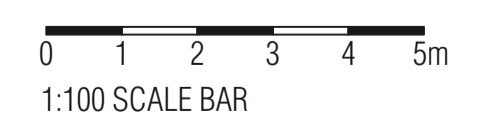
COMMUNITY HALL GROUND FLOOR PLAN