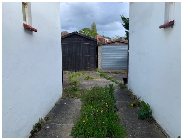
15 Gladstone Avenue

The siting of the building will align with the front of the neighbouring garage and be lower than the ridge (15 Gladstone Avenue). The new building will run parallel to the boundary with 15 Gladstone Avenue to leave a 2m wide flower bed at the bottom of the garden where the site bounds with 2 Rosecroft Gardens.