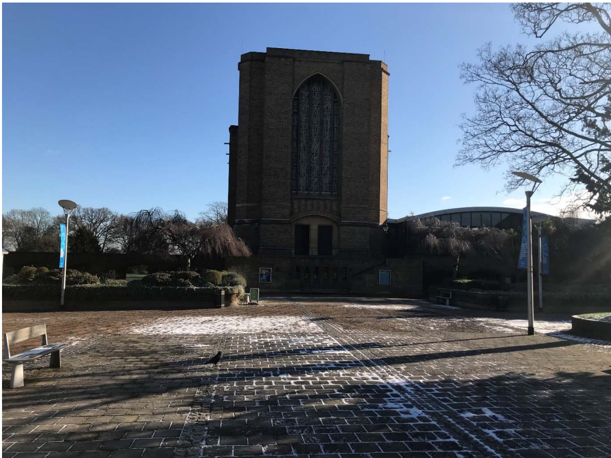
Chapel View in winter

The application area is outside the St Mary's University Chapel which was built in the early 1960's and is Grade II listed. There are undercrofts both sides of the Chapel and 2no. raised flower beds in front of the undercrofts which are all later additions.