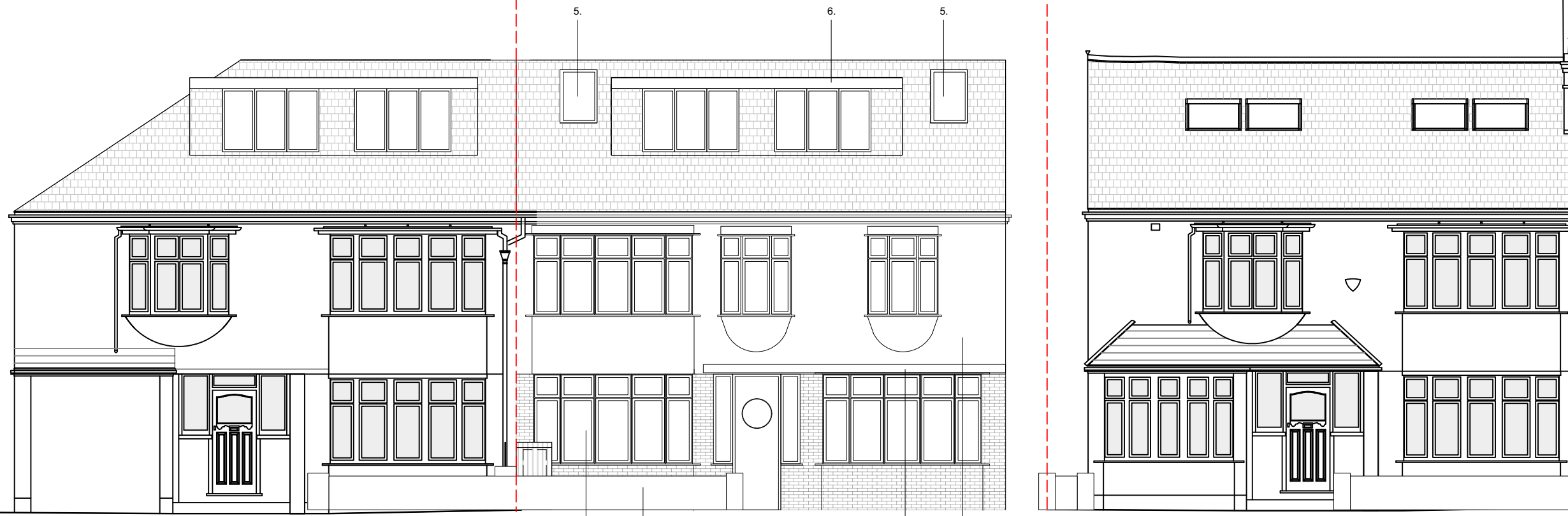
6 North Elevation Scale: 1:100