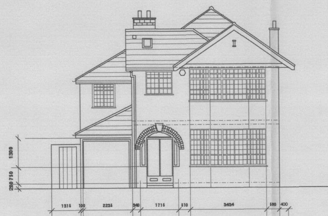
FRONT ELEVATION ( NO CHANGES PROPOSED ) 1:100