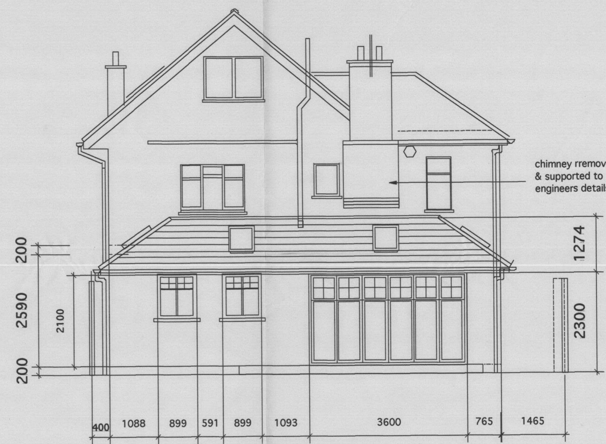
REAR ELEVATION 1:50

chimney removed & supported to engineers details