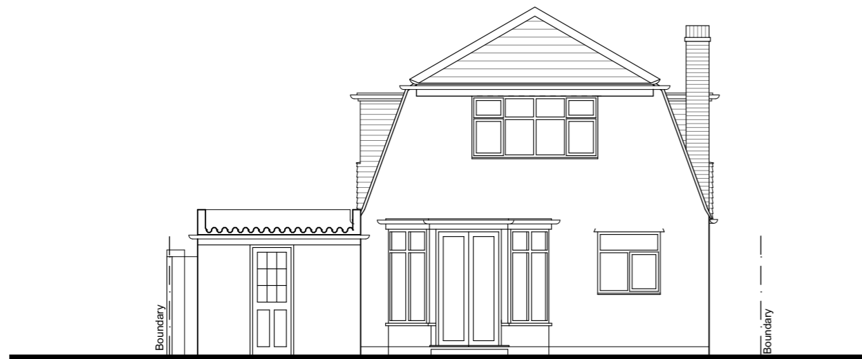
Existing Front (S) Elevation @1:100 Scale