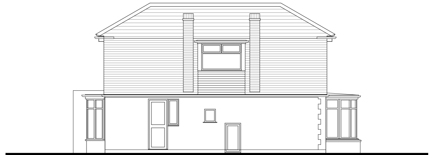
Existing Side (E) Elevation @1:100 Scale

Project Name: 62 Bridge Way, Twickenham Client Name: Mr Snow & Ms Mason Drawing Scale: 1:100 Scale @ A3 Drawn by: apd Checked by: Drawing No.: 1066-03