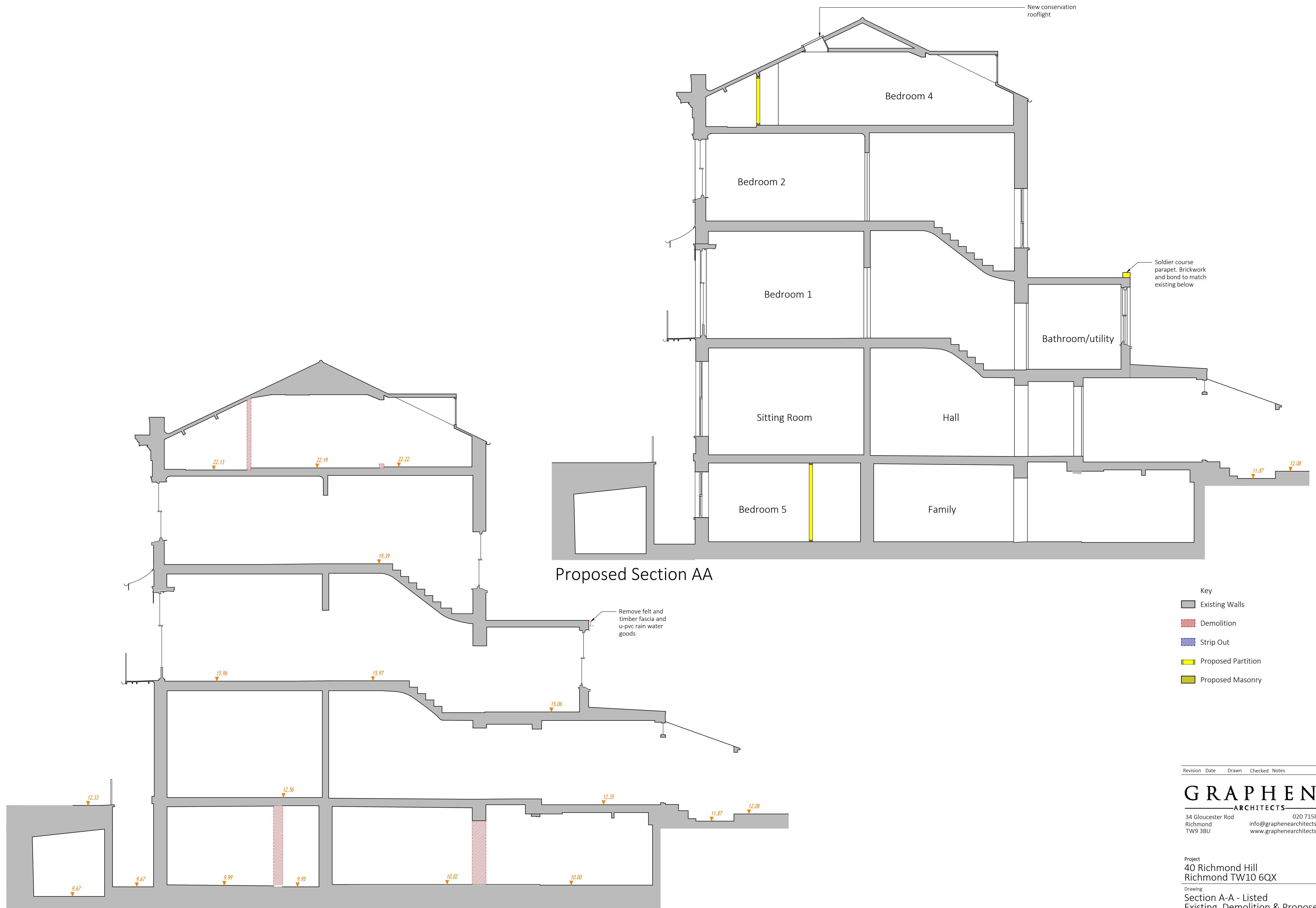
Proposed Section AA