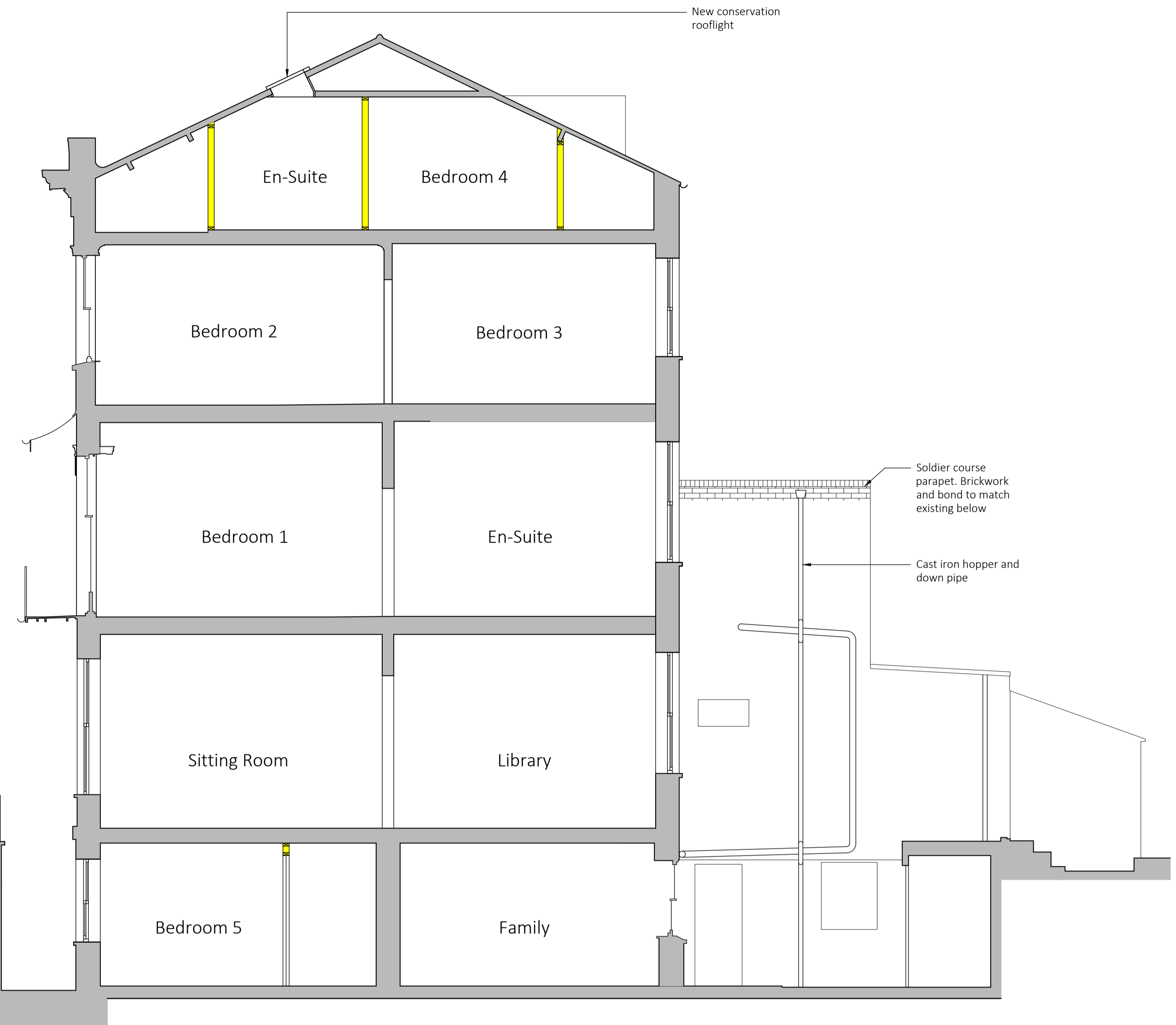
Proposed Section BB