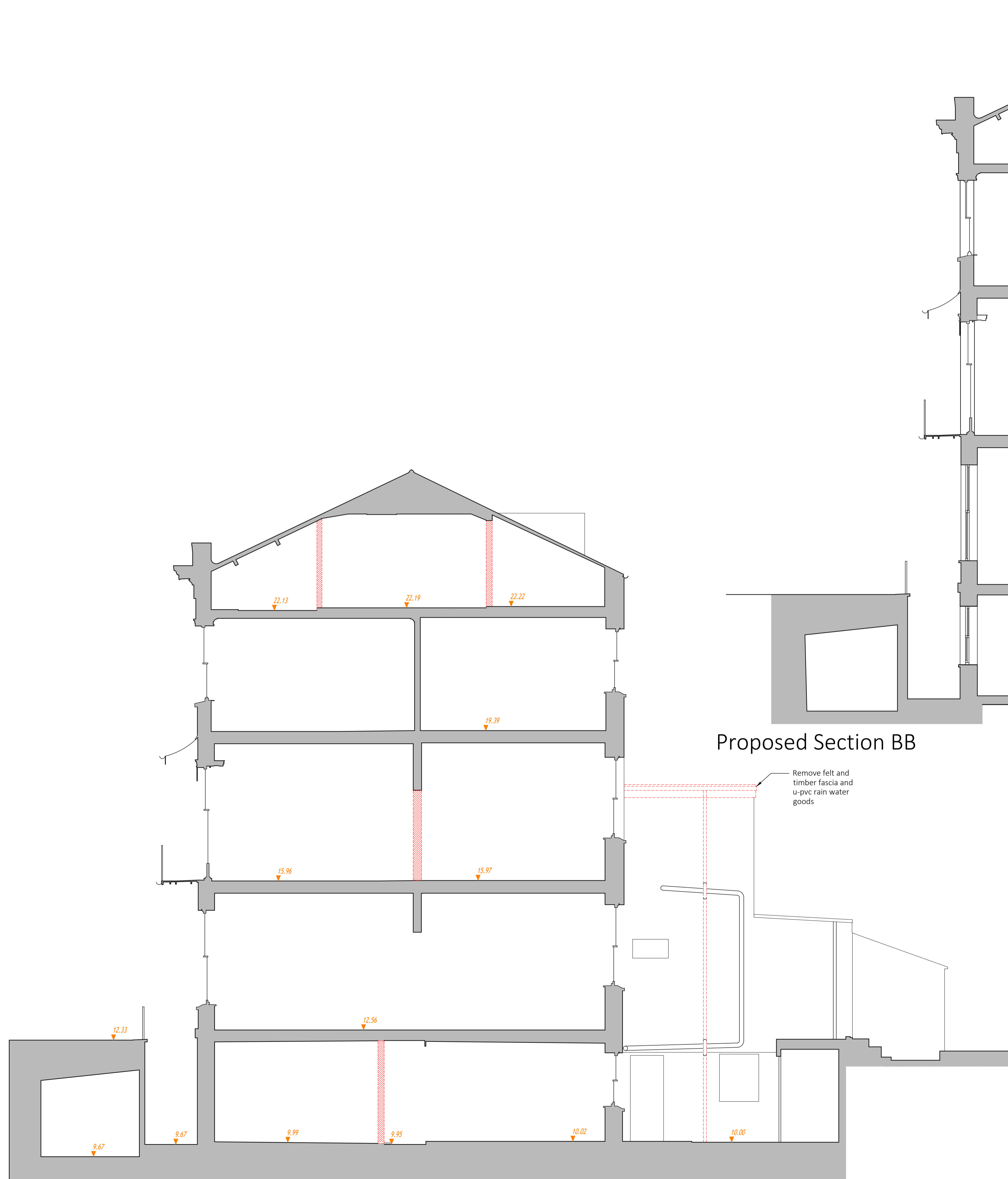
Existing Section BB With Demolition