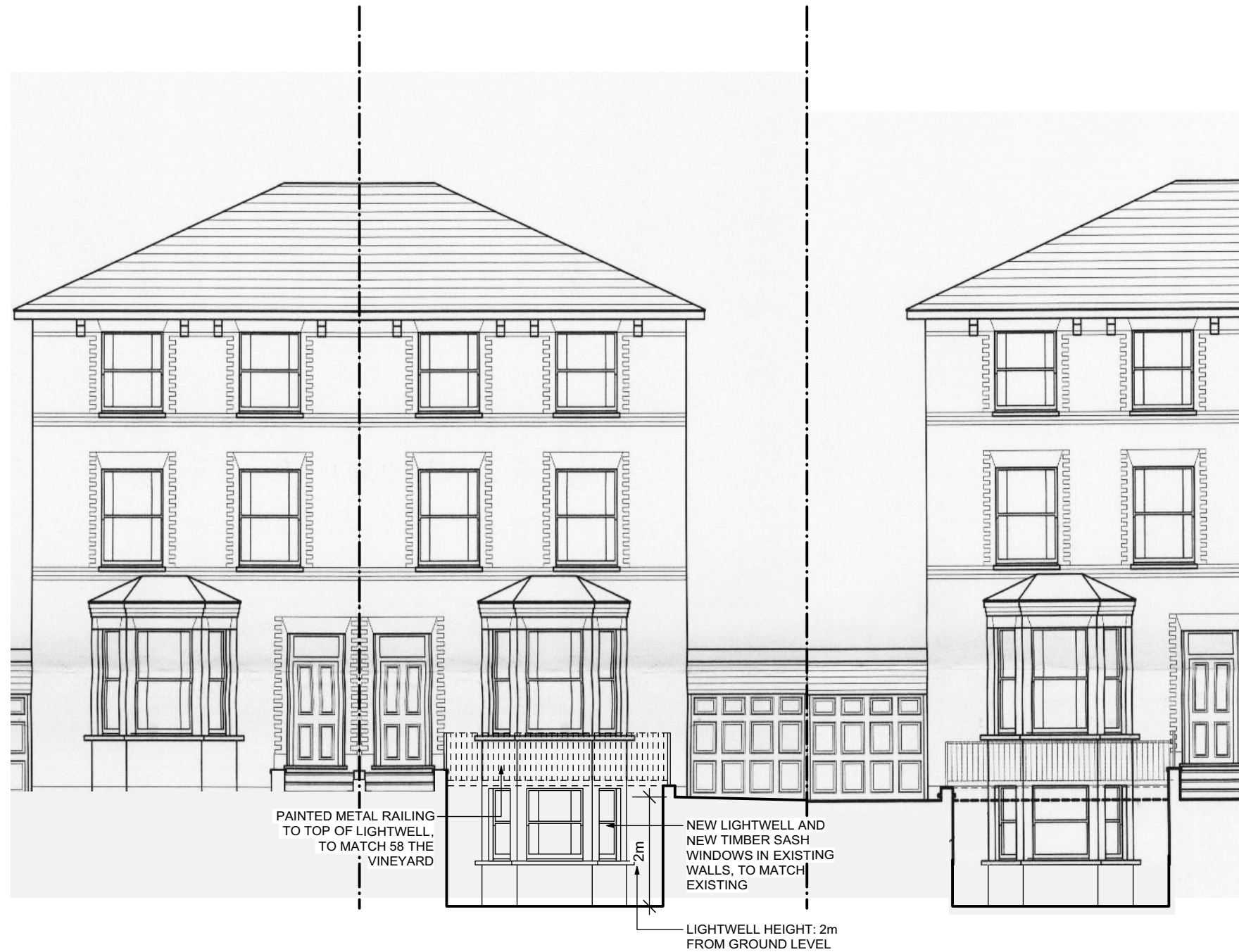
54 The Vineyard