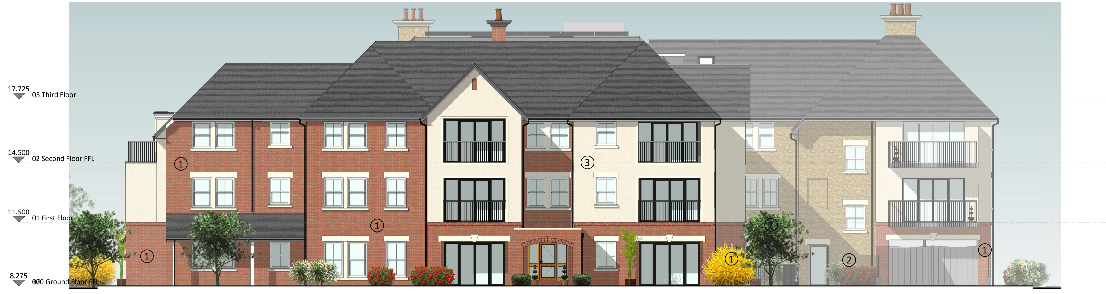
North Elevation (Station Road) 1 : 100