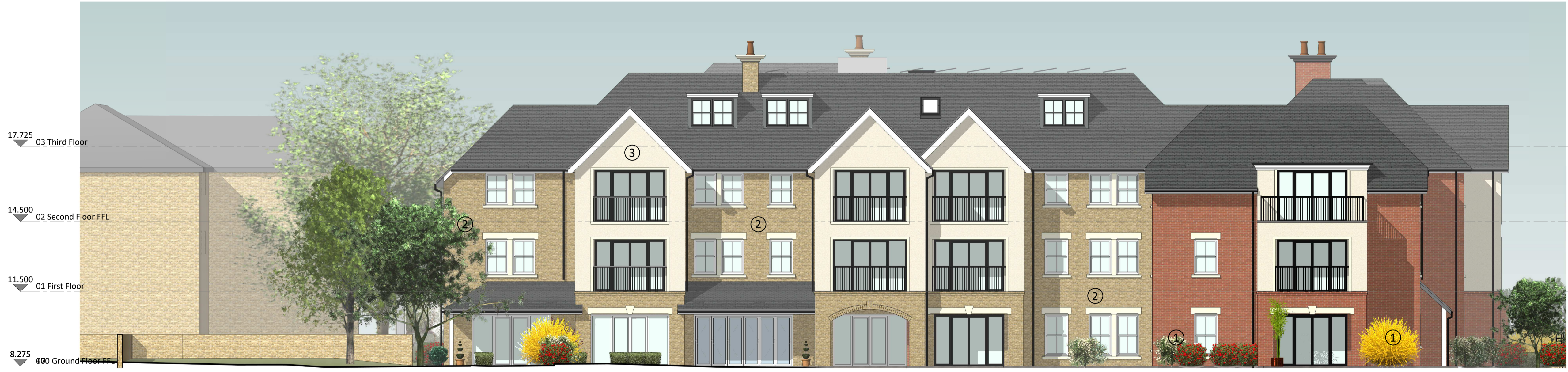
East Elevation (Towards Lower Teddington Road) 1 : 100