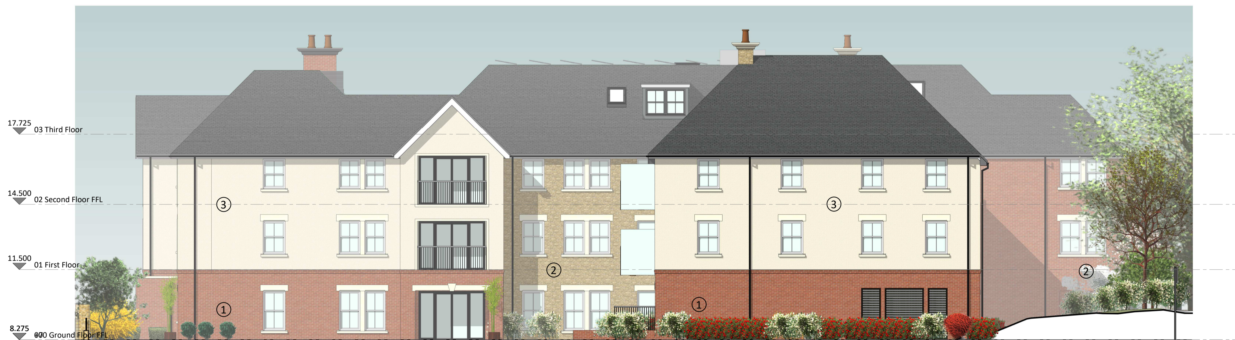
West Elevation (Wick House) 1 : 100