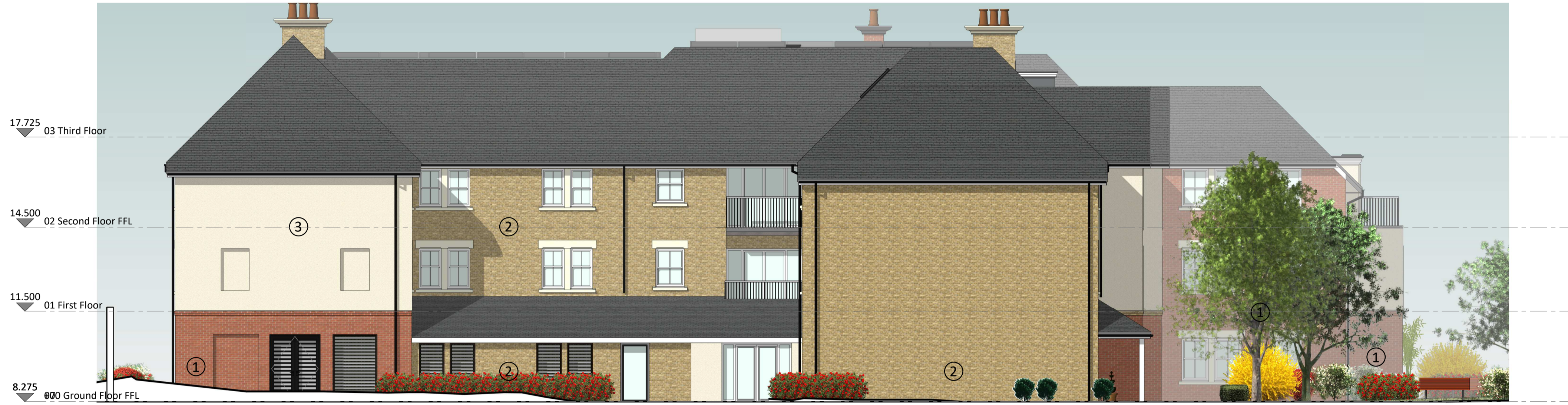
South Elevation (Seymour Lodge) 1 : 100