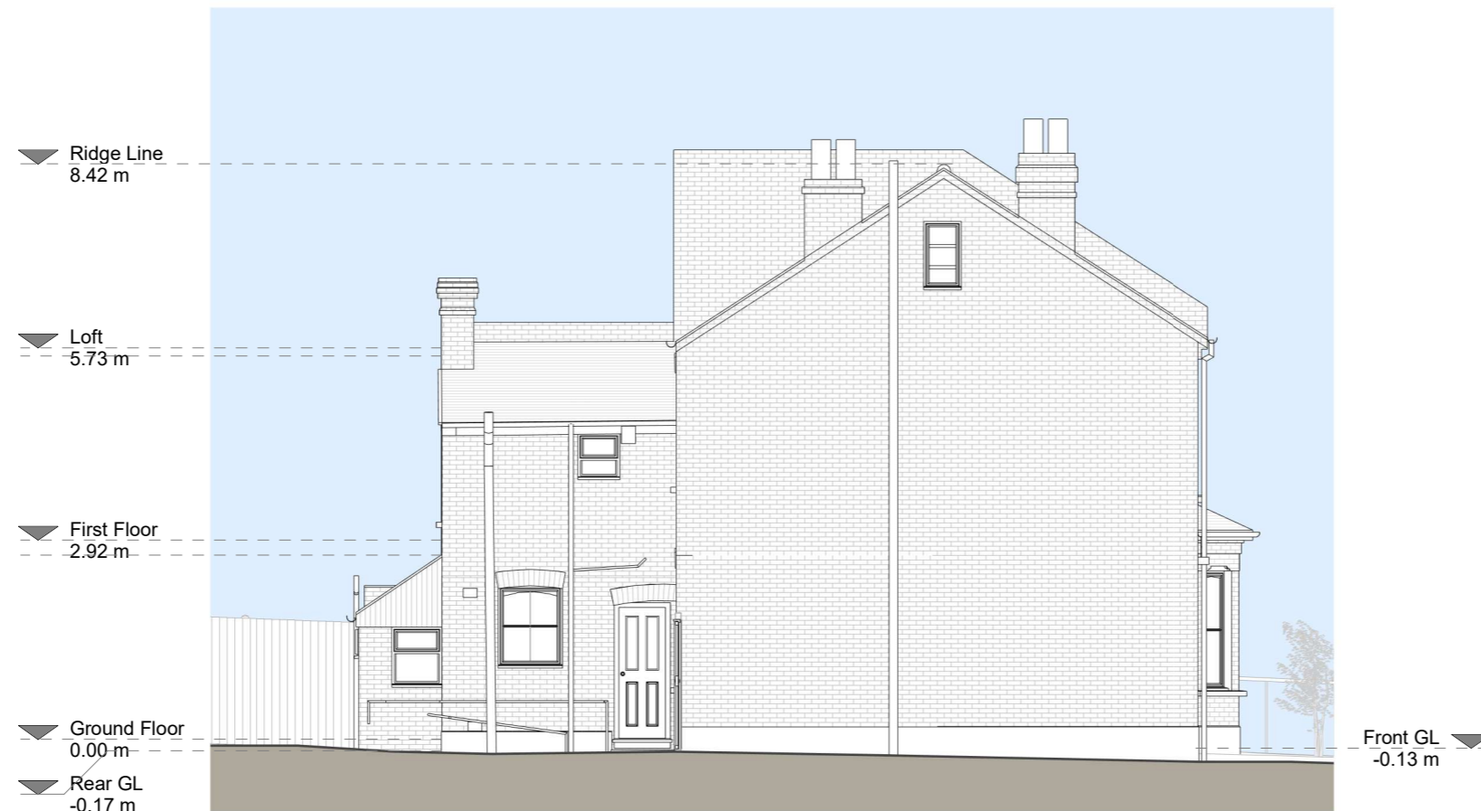
Left Side Elevation