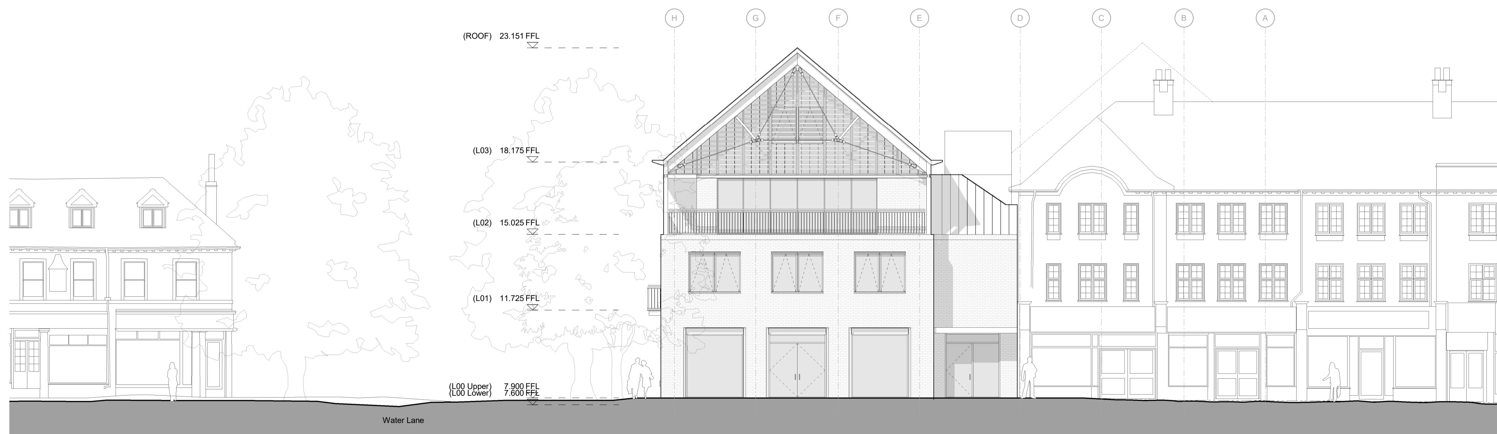
2 Water Lane - King Street Elevation 2660 1:100