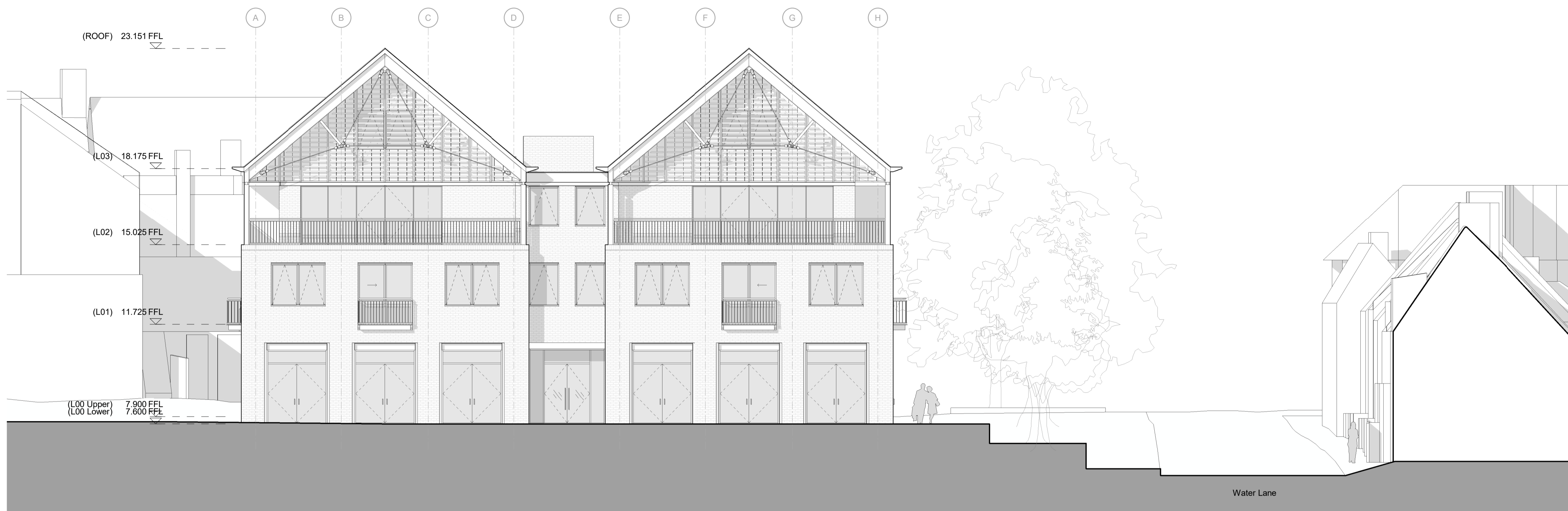
1 Water Lane - Garden Elevation 2660 1:100