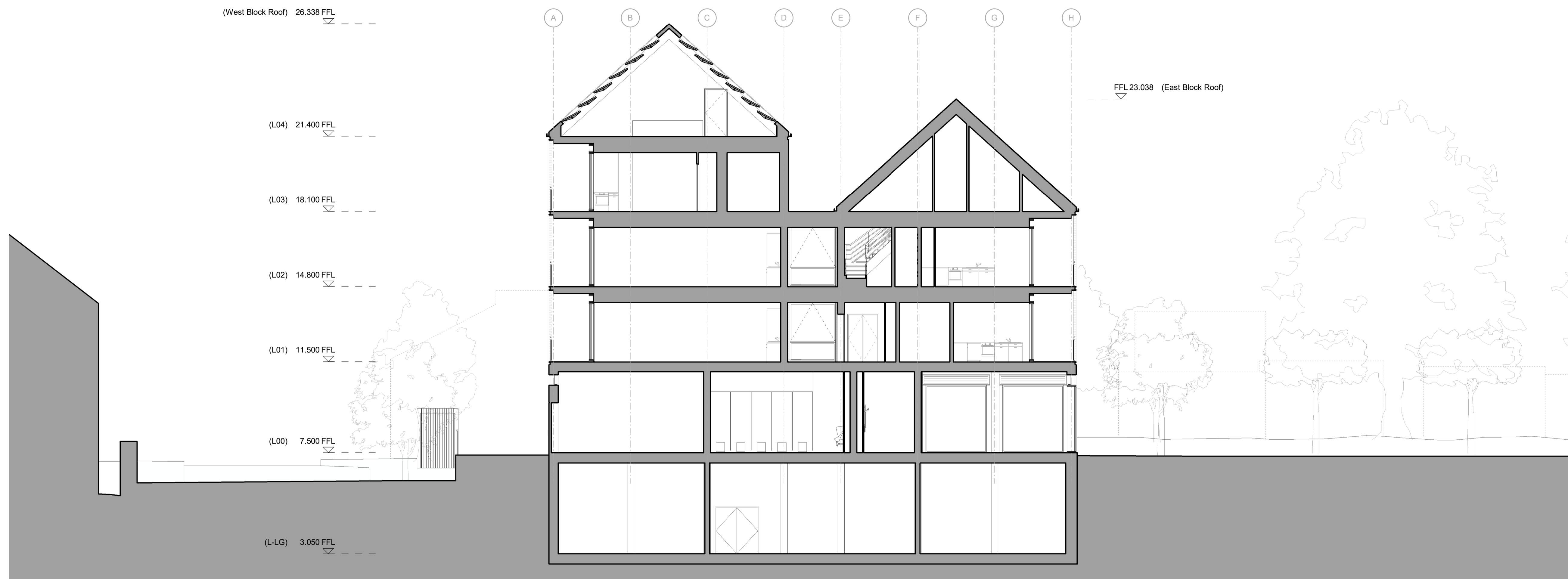
1 Wharf Lane - Section through Wharf Lane Building 2604 1:100