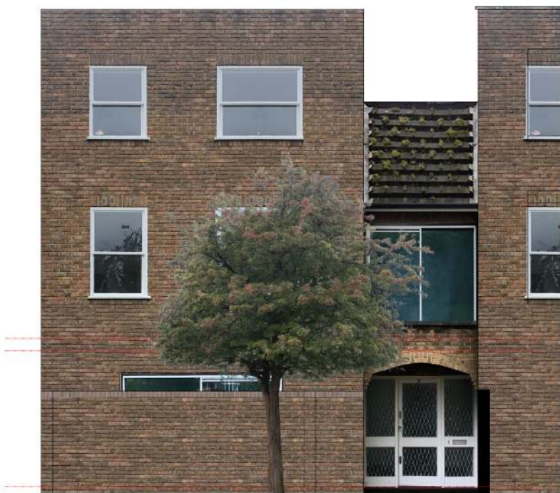
EXISTING STREET ELEVATION