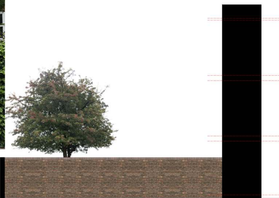
EXISTING SOUTH SECTION