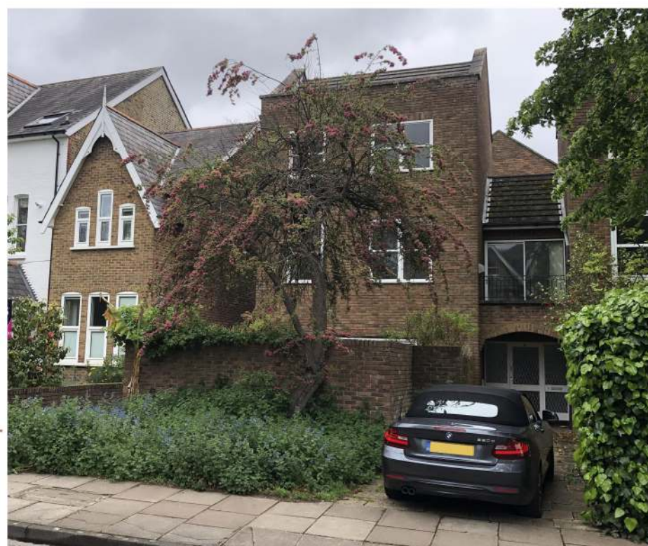
EXISTING STREET VIEW