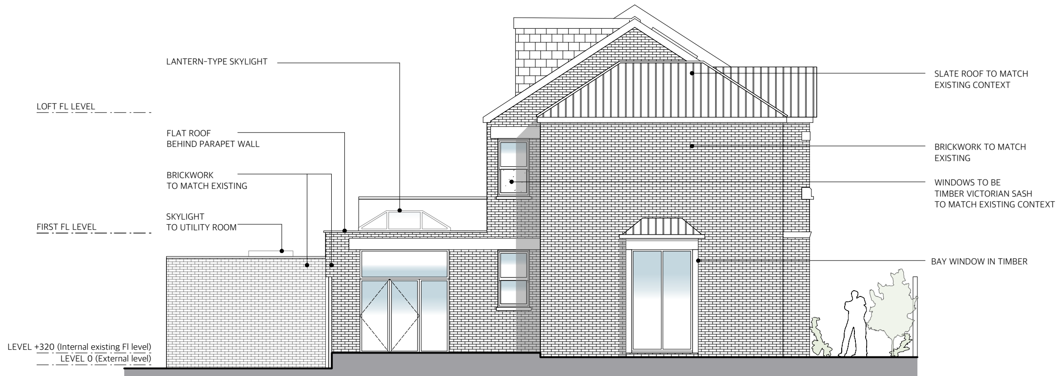
PROPOSED SECTION C-C