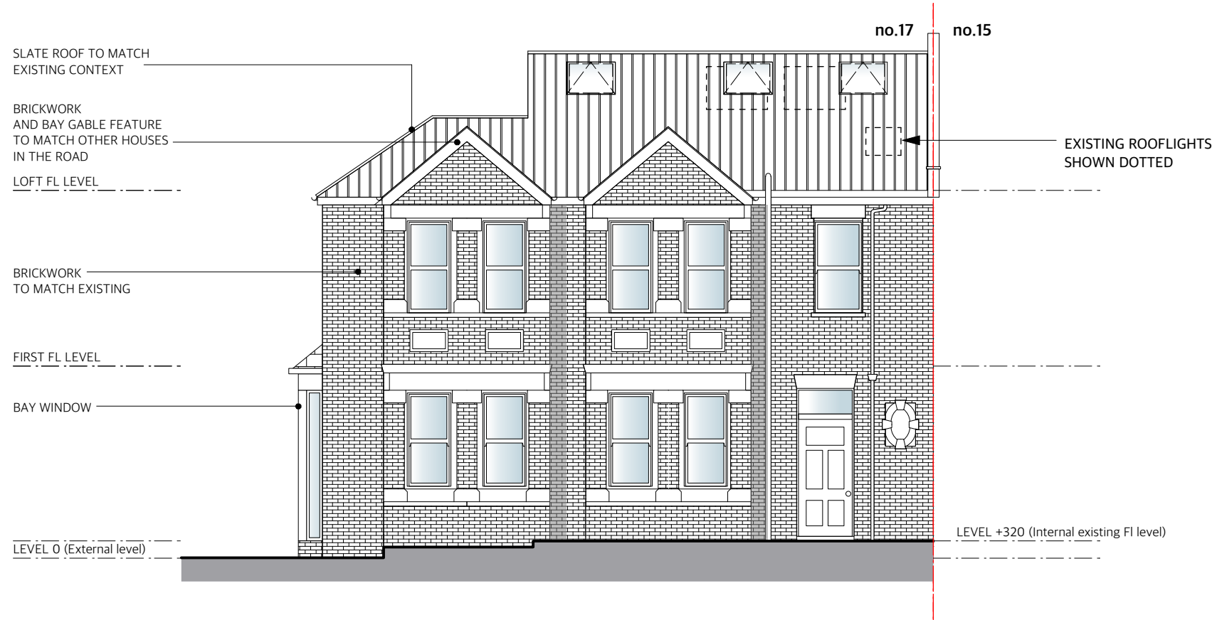
PROPOSED SECTION B-B