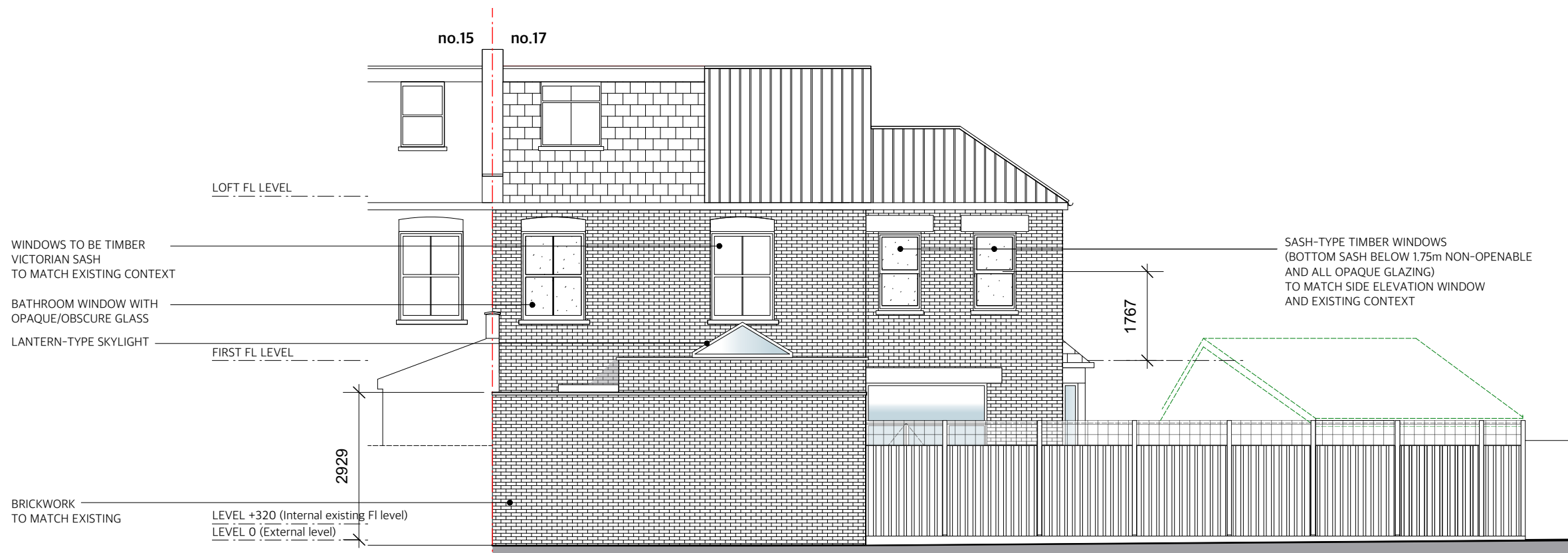
PROPOSED REAR ELEVATION FROM REAR PASSAGE