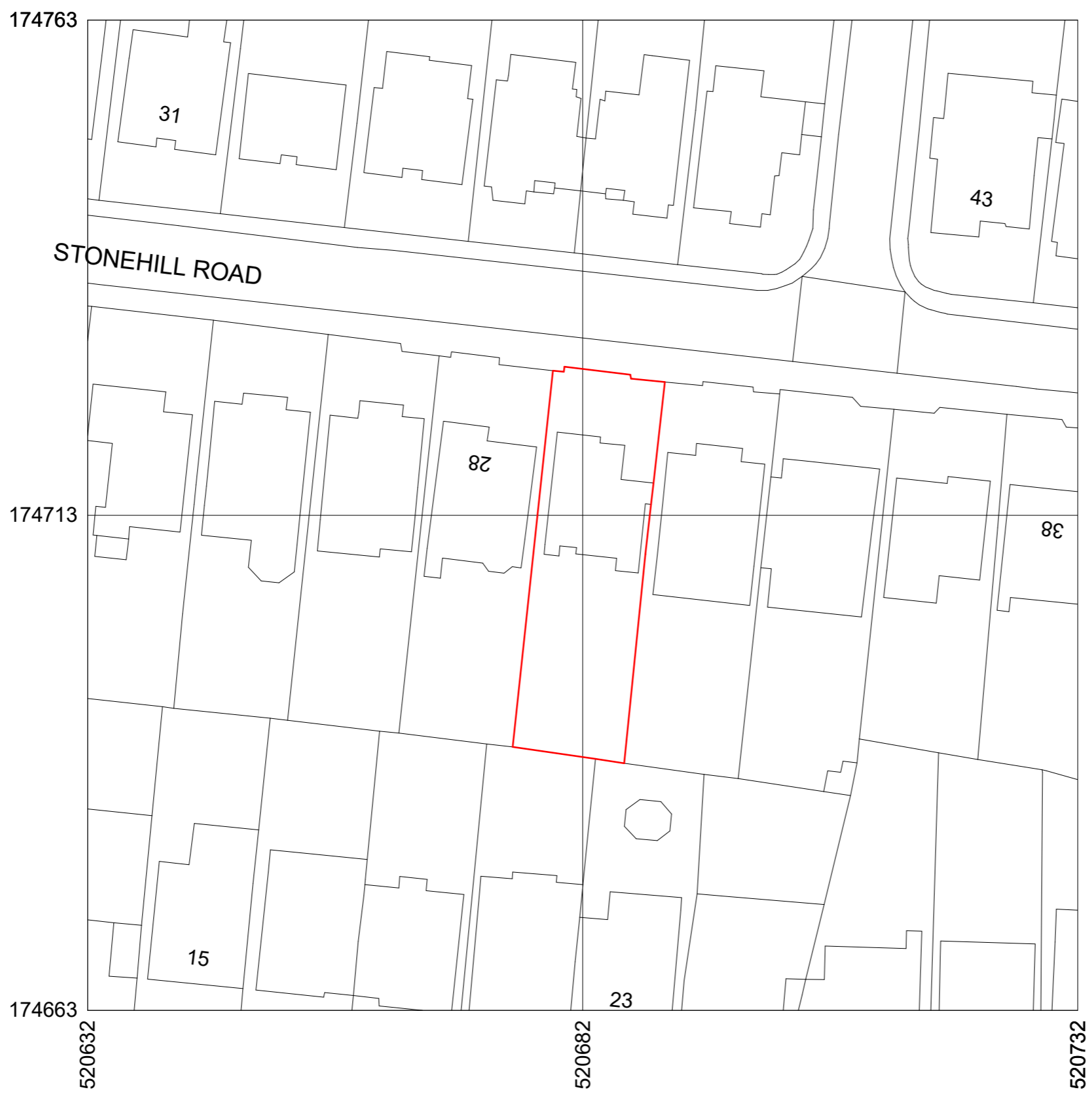
① Location Plan Scale 1 : 500