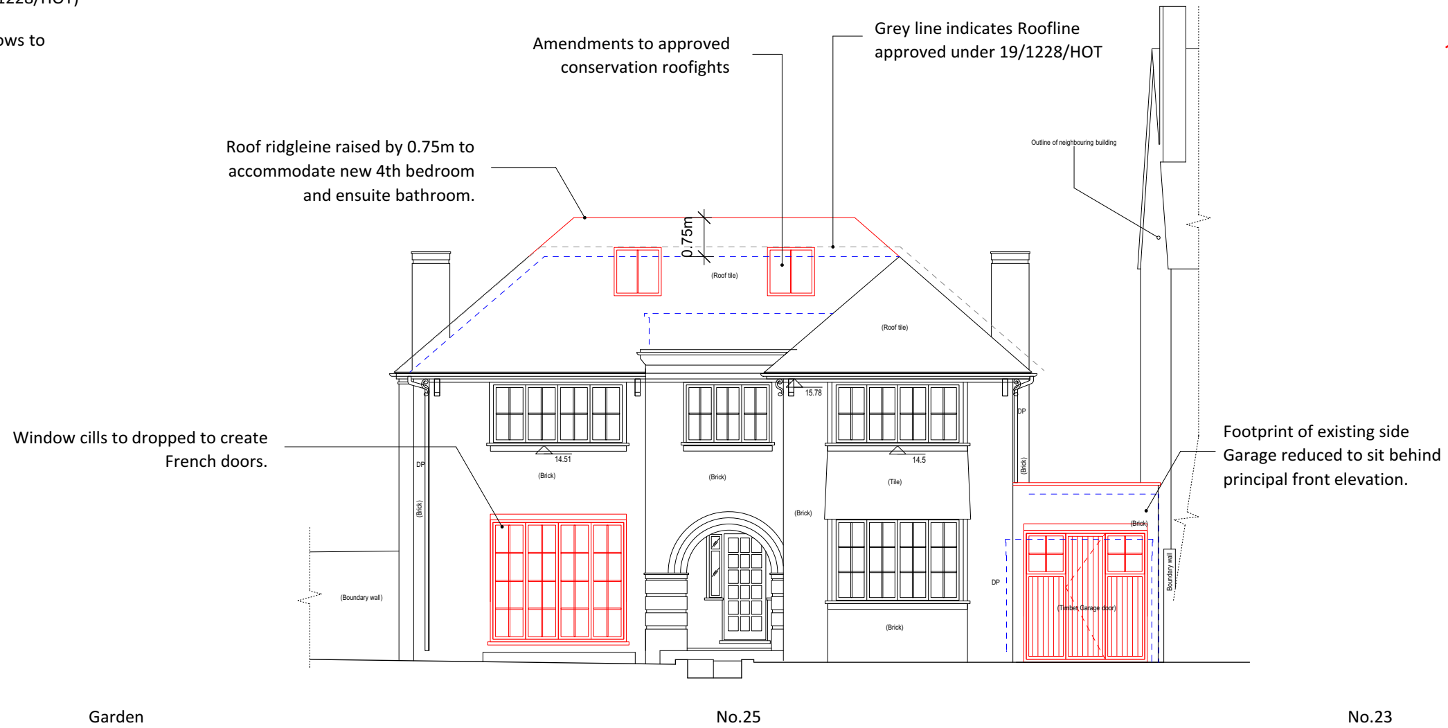
1 Proposed Front Elevation Scale: 1:100