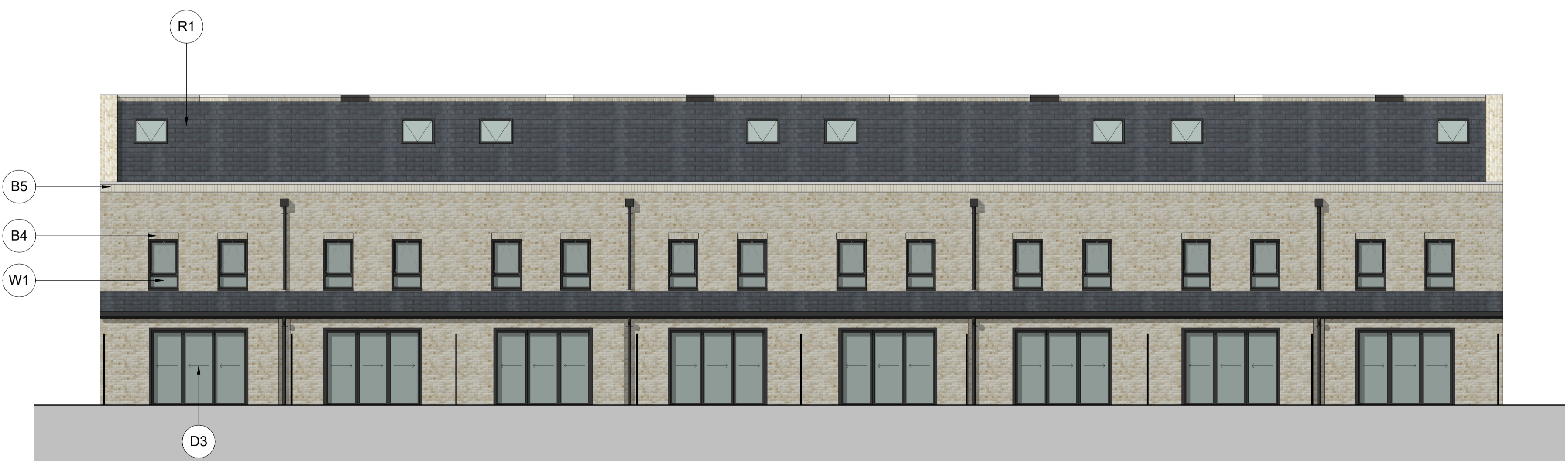
Elevation C 1 : 100