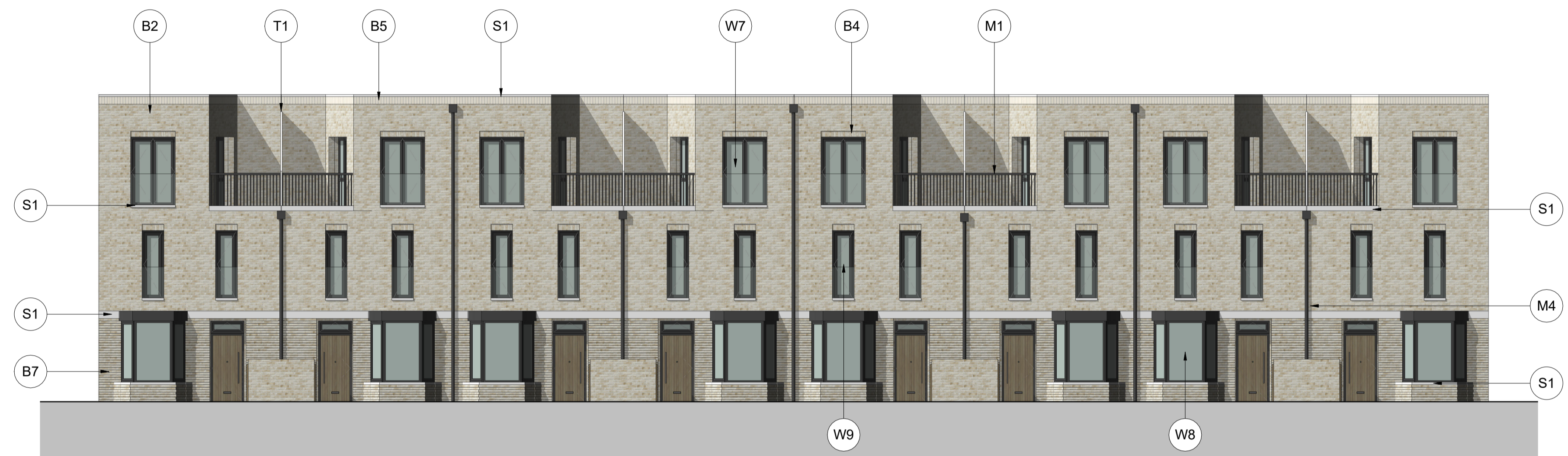
Elevation A 1 : 100