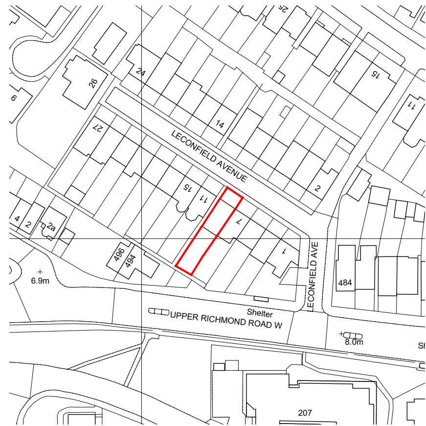
Site Location Plan Scale 1:1250 @ A3