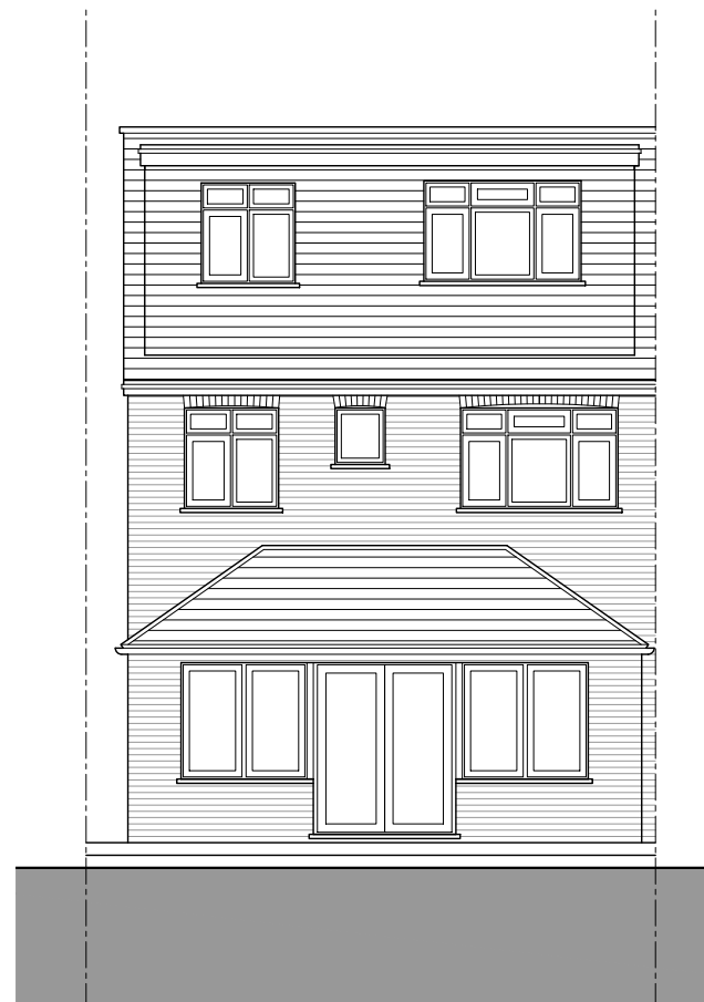
Existing Rear Elevation Scale 1:100 @ A3