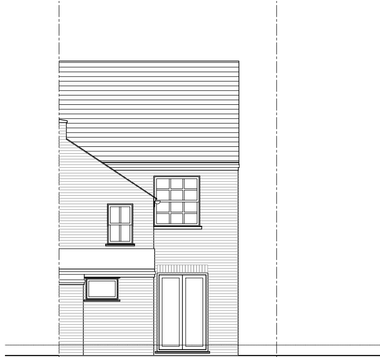
Existing Rear Elevation Scale 1:100 @ A3