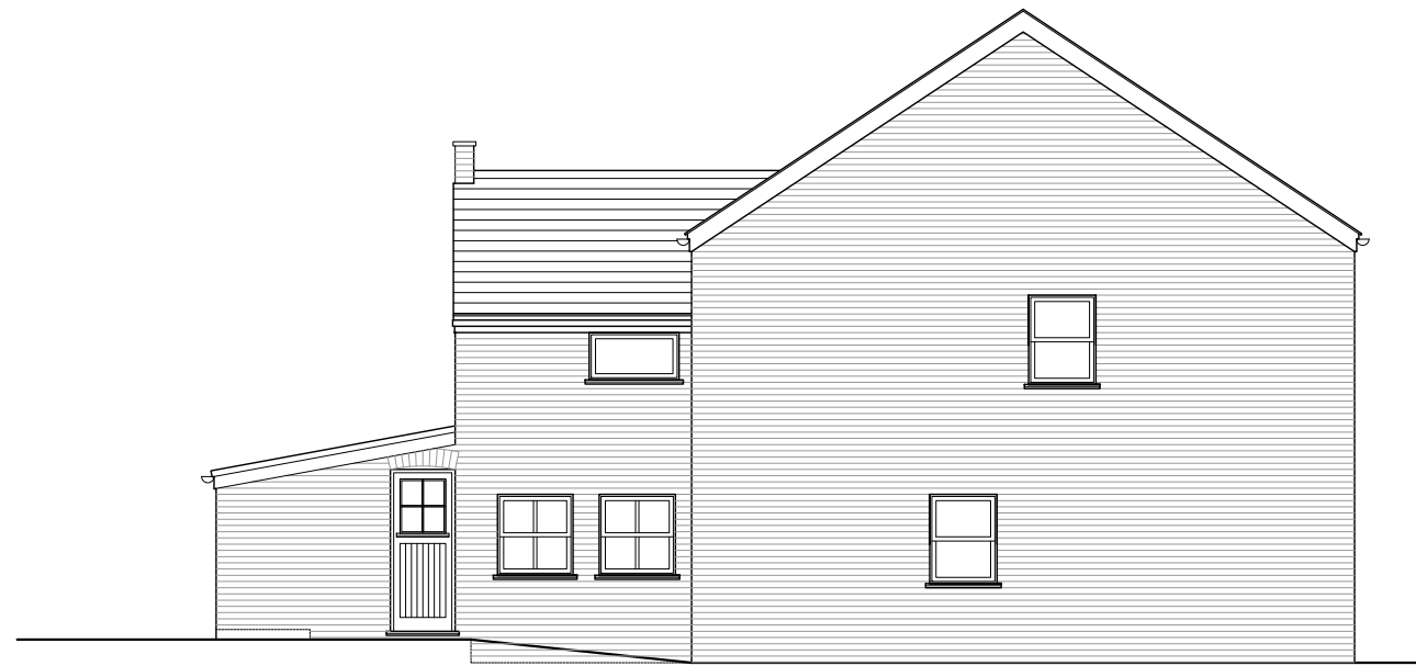
Existing Side Elevation Scale 1:100 @ A3