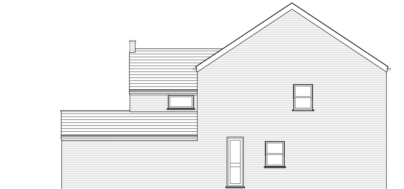
Proposed Side Elevation Scale 1:100 @ A3