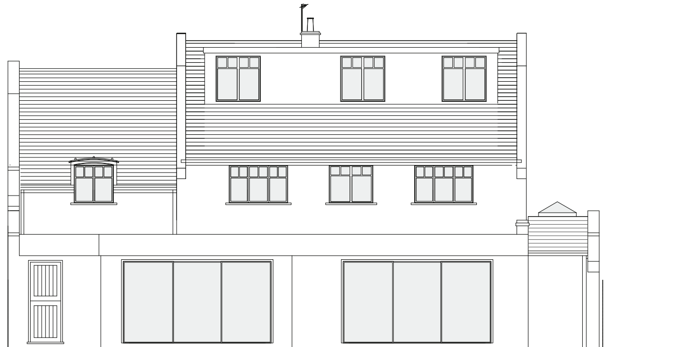
WEST ELEVATION, SCALE 1:100