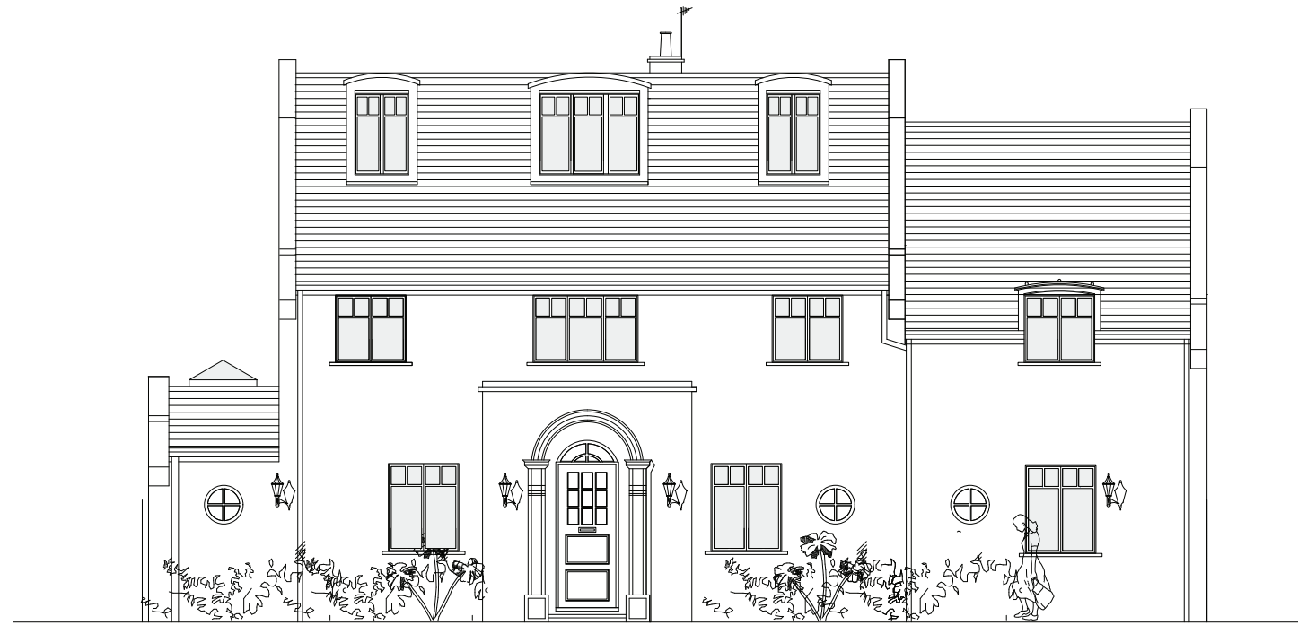
EAST ELEVATION, SCALE 1:100