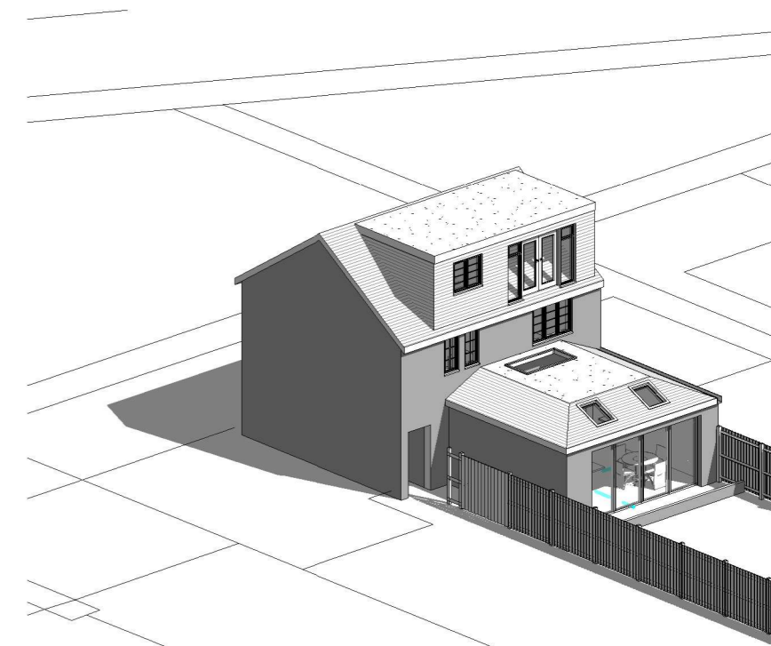
4 Proposed 3D View 2