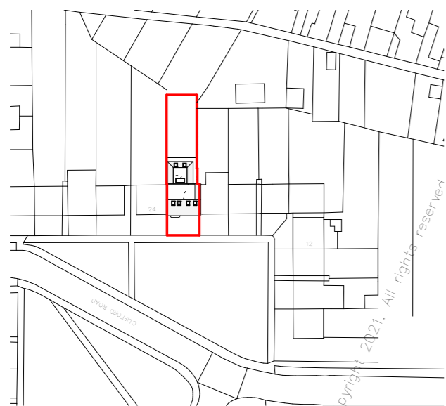
1 Proposed Location Plan 1 : 1250