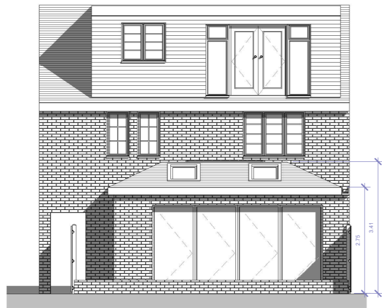
Proposed Rear Elevation 1 : 100