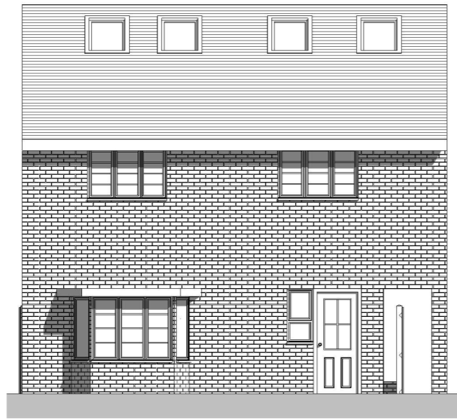
Proposed Front Elevation 1 : 100