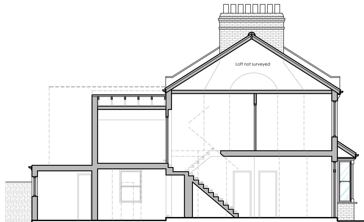
EXISTING SECTION A-A