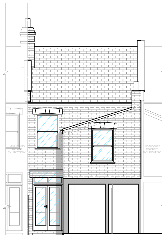
No 157 EXISTING SECTION B-B No 153