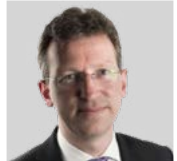
Rt Hon Jeremy Wright QC MP

I am proud to present the work which my Department, and our colleagues in the arms-length bodies we support, such as the Arts Council and Sport England, are doing to help places flourish. I hope Local Enterprise Partnerships and other policy-makers will make good use of this manual and help our sectors to make their full contribution to local prosperity.