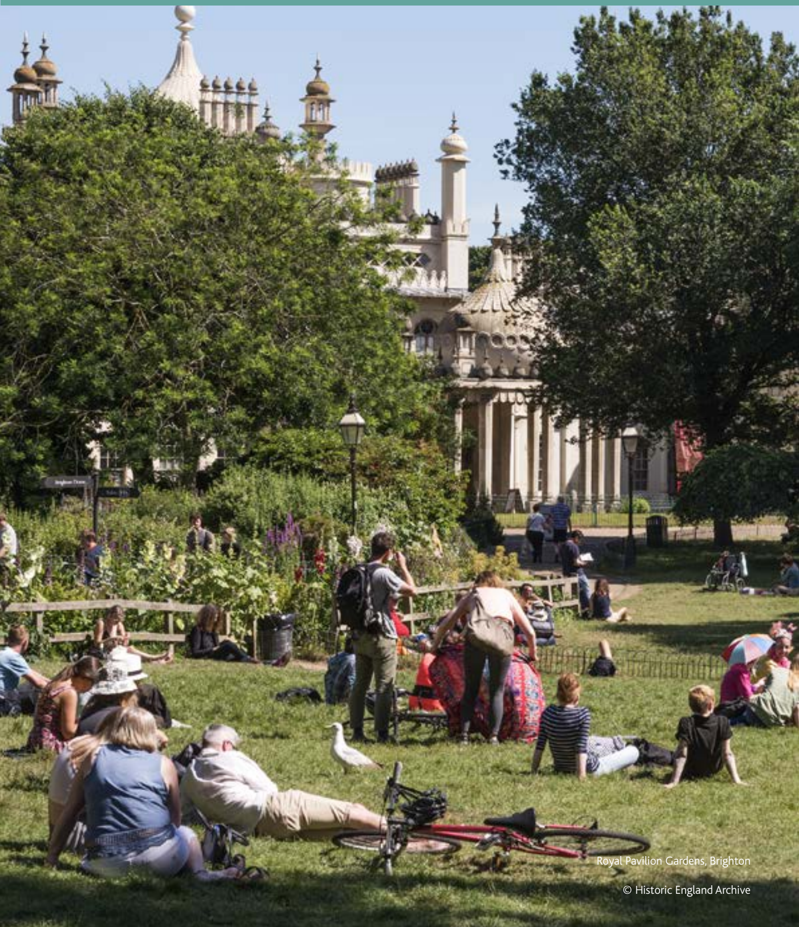
Royal Pavilion Gardens, Brighton