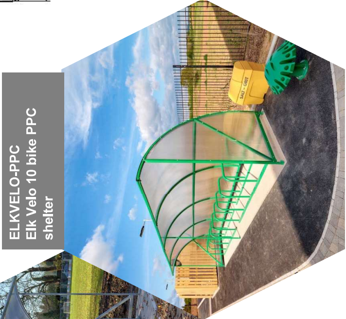
ELKVELO-PPC Elk Velo 10 bike PPC shelter