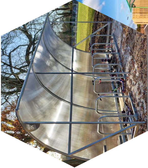
ELKVELO-G Elk Velo 10 bike Galvanised shelter -

The Elk Velo cycle shelter can be supplied in galvanised or galvanized & PPC finish. The shelter comes in 10 bike ‘bays’ which can be put together to achieve the size required.